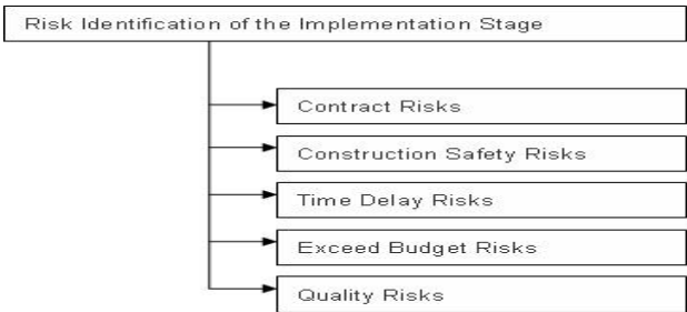
Chart 4. Breakdown Structure chart for Risk Identification of the Implementation Stage

In addition, foster good relations with the local government, administration department and other agencies. When encounter problems, communicate with the government departments in timely. Obtain their support and help for the real estate project. Thus we can reduce the risk, get less loss and unnecessary troubles.