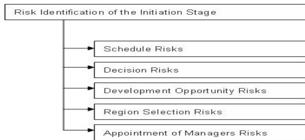
Chart 2. Work Breakdown Structure Chart for Risk Identification of the Initiation Stage