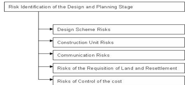
Chart 3. Work Breakdown Structure Chart for Risk Identification of the Design and Planning Stage