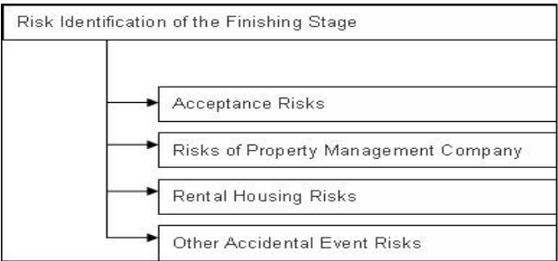
Chart 5. Work Breakdown Structure Chart for Risk Identification of the Finishing Stage

With the wide application of computer tools, project schedule management entered a new stage. Information technology in these aspects has extraordinary performance. It provides a simple and convenient optimization schedule management method. Real estate project managers can handle changes efficiently; and reduce repetitive work of the planning review staffs greatly. Shorten the construction period effectively as well.