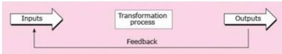
Figure 1 The transformation model

The discussion above has highlighted the role of operations in creating and delivering the goods and services produced by an organization for its customers. This section introduces the transformation model for analyzing operations. This is shown in Figure 1 , which represents the three components of operations: inputs, transformation processes and outputs. Operations management involves the systematic direction and control of the processes that transform resources (inputs) into finished goods or services for customers or clients (outputs). This basic transformation model applies equally in manufacturing and service organizations and in both the private and not-for-profit sectors.