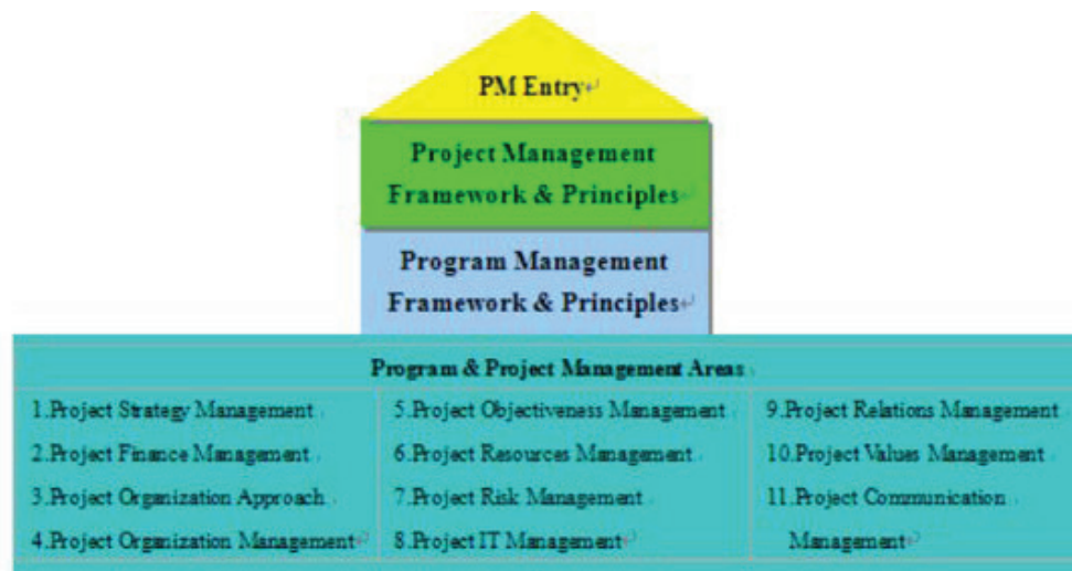
FIGURE 2. P2M [22]

In contrast, SCRUM generates usually scope creep and lives with it because there are a regular and repeated changes on the scope by the stakeholders through process called a sprint which start by asking for changes or adding more requirements on the scope after the project start [8]. Simply, its main concern to start the development and it is a framework for developing and sustaining complex products [19]. International Project Management Association Competence Baseline (ICB) sets a quality standards and requirements as baseline to achieve and fulfil the project deliverables (scope) within time frame and cost controlled operation [20]. The scope in ICB indicated in execution phase with no specific procedures as scope management [20]. However, in Project & Program Management P2M the part which heightened the scope manage is Project Objectives/ Goal Management which concerns with meeting or exceed stakeholders satisfaction by attaining scope and quality within time and budget [21].