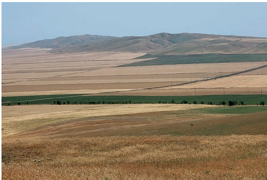
Shiraki Plateau