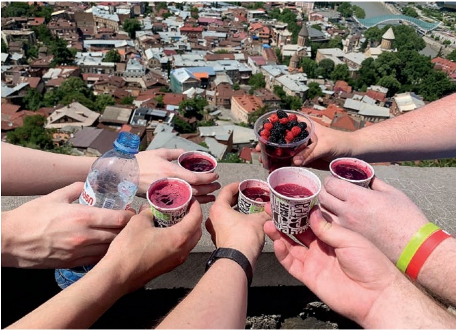
Pomegranate juice in T'bilisi

challenged by the task of identifying and constructing extensive measures to ensure students' safety while maximizing their learning opportunities, often designed to go unnoticed by the students. At the same time, we found the need to explicitly prepare them for the level of uncertainty in research, field work, and travel. We trusted that students would accept, adapt, and thrive in this uncertainty and they rose to the occasion.