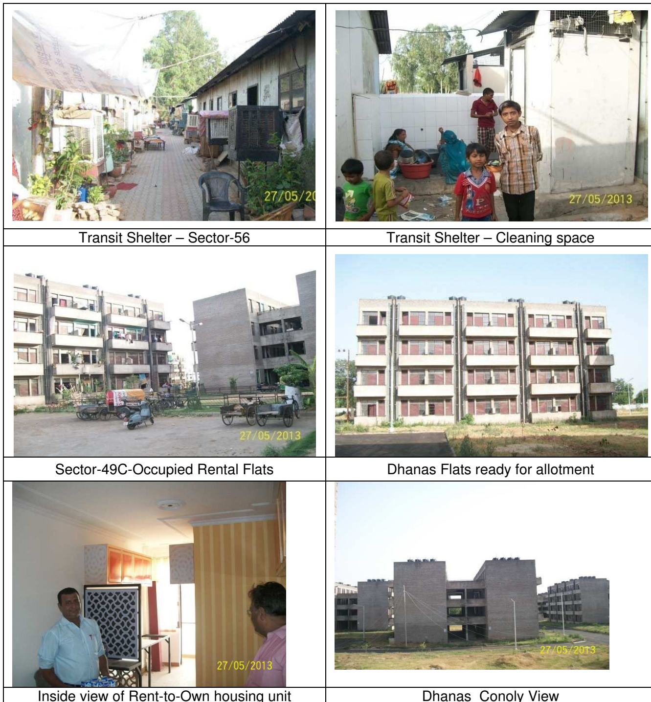
Figure 3: Rent-to-Own Housing, Chandigarh

of the joint allottees with their sanctioned flat number and documentation related to utility services (water and electricity connection) are issued on the spot. Srishti sped the turnaround time for application and allotment immensely by speeding the entire process to just a few hours. Through such efficient application CHB managed to shift over 700 families from a slum site (Madrasi Colony) to Sector 56 within a matter of few days, a process that generally takes 6 months to 2 years in normal circumstances. This software also helped to put to rest any possible claims and counter claims as regards to the eligibility criteria. This process was further facilitated through the organised coordination and presence of other line departments and offices (Engineering Department, Estate Office, Municipal Corporation, a scheduled commercial bank, Notary Public) at the allotment camps. These arrangements are the biggest strength of this scheme.