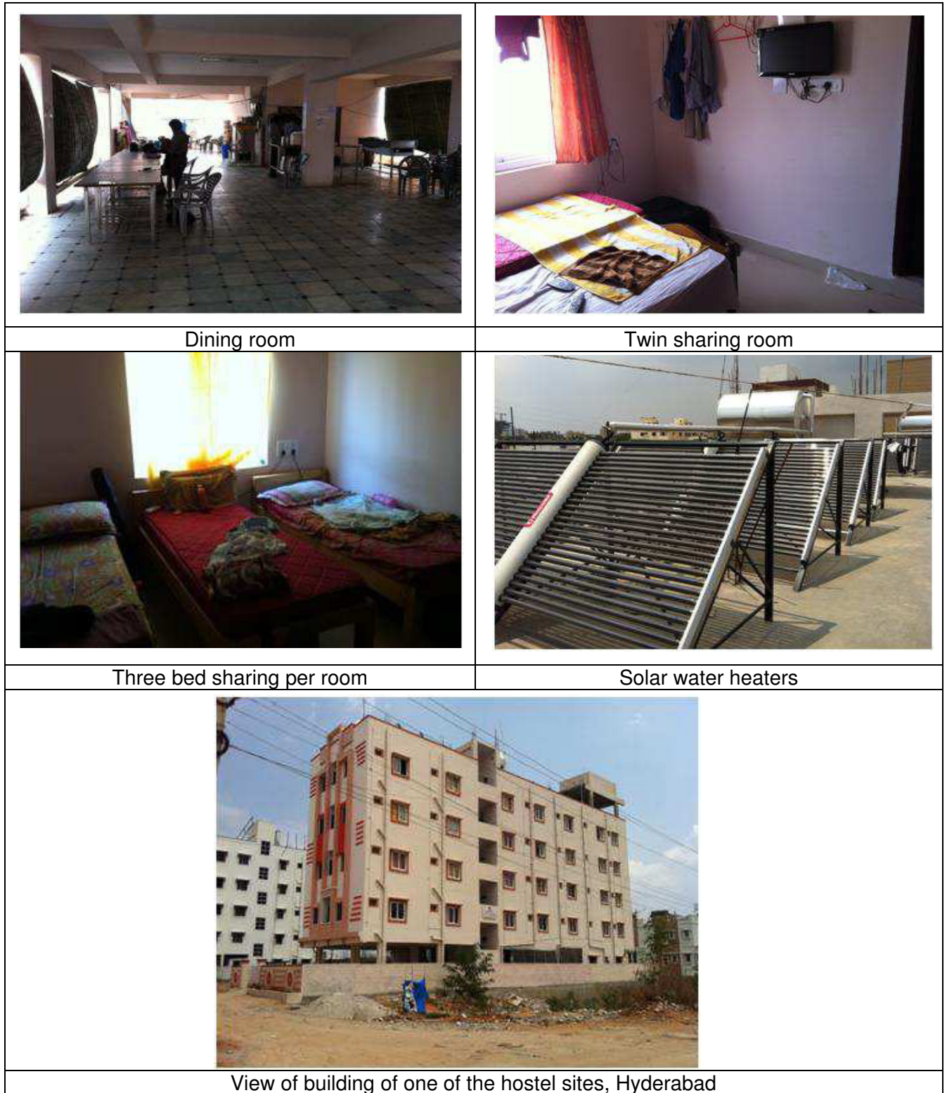
View of building of one of the hostel sites, Hyderabad

Key concerns and issues. Some key challenges and issues of the aforementioned retail rental housing model for short term migrants in the formal market are observed through this case study and can be summarized below: