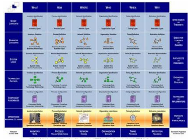
Figure 1: Zachman Framework ( http://zachmaninternational.com/index.php/home-article/13 )

The columns in the Zachman Framework include: