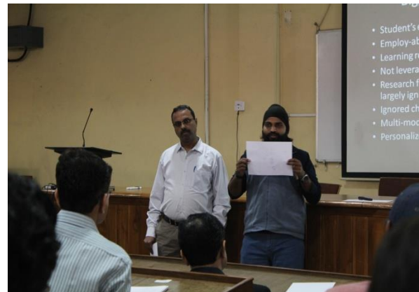
Team members explaining their improvised idea