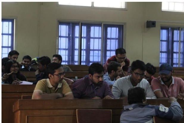
Participants working on task in groups