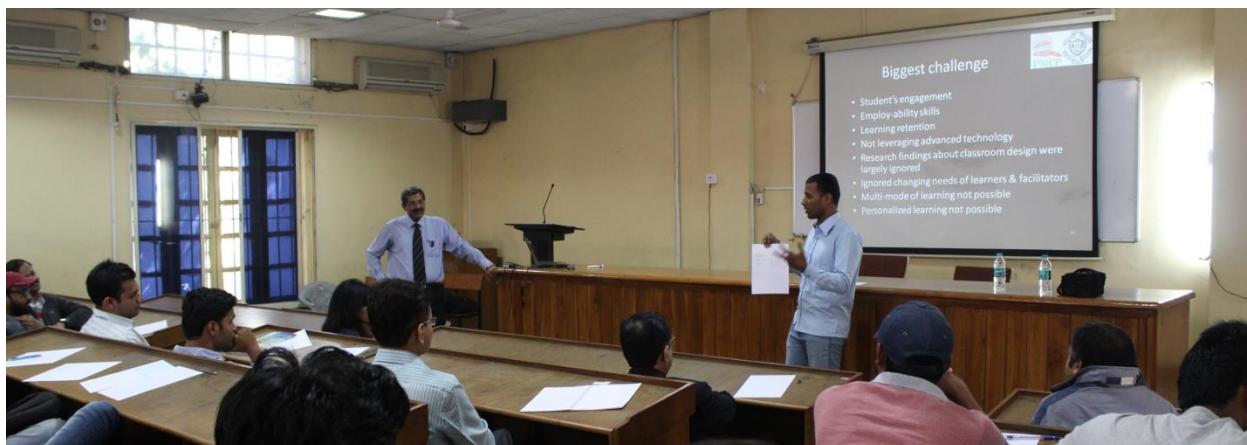
Team members explaining their improvised idea