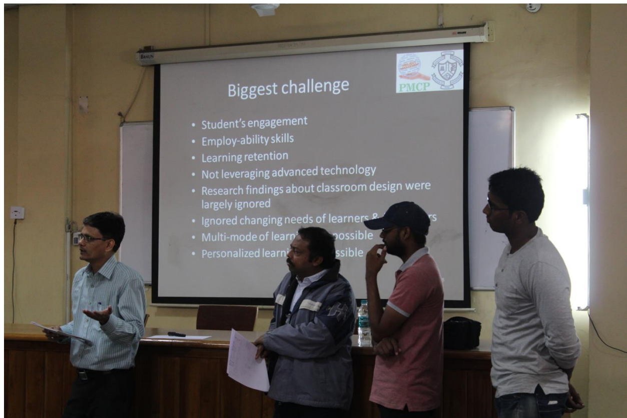
Second Team members explaining their improvised idea