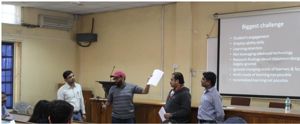
Team members explaining their improvised idea