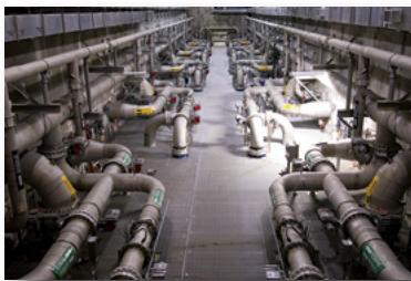
Filter gallery pipes at our Lee Hall Water Treatment Plant.

Untreated water is pumped to our treatment plants, where it passes through screens before aluminum sulfate (alum) and polymer are added. These chemicals cause tiny particles in the water to cling together (coagulation), making the particles easier to remove. After the water is clarified, ozone (disinfection) is added to kill micro-organisms such as bacteria and viruses. The water is then sent through filters to remove any remaining particles (filtration). Lime is added to adjust the pH, fluoride is added to prevent tooth decay, and zinc orthophosphate is added to control corrosion inside the pipes. Finally, chloramines, the secondary disinfectant, are added to maintain disinfection through the pipe system while the water travels to your home or business.