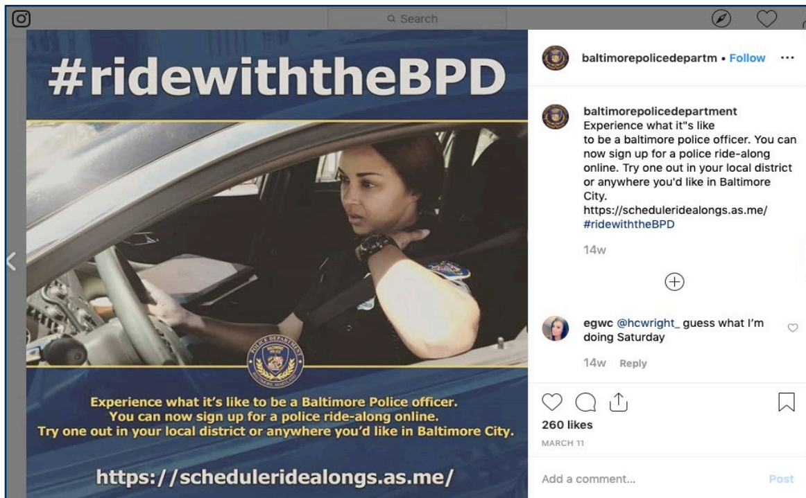
Figure 3: Baltimore Police Department Instagram Content 12