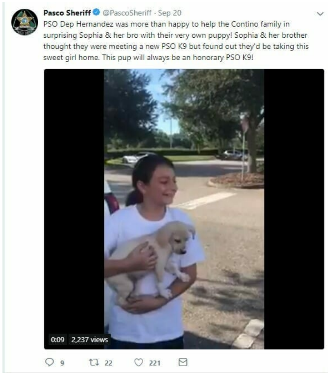
Figure 2: Mountain View Police Department Twitter Content 11

The samples below include examples of public safety organizations using different social media platforms to share engaging content with their communities. Figure 2 demonstrates an agency building trust on day-to-day operations through positive engagement on Twitter and Figure 3 demonstrates building trust through Instagram engagement by offering a ride along to citizens.