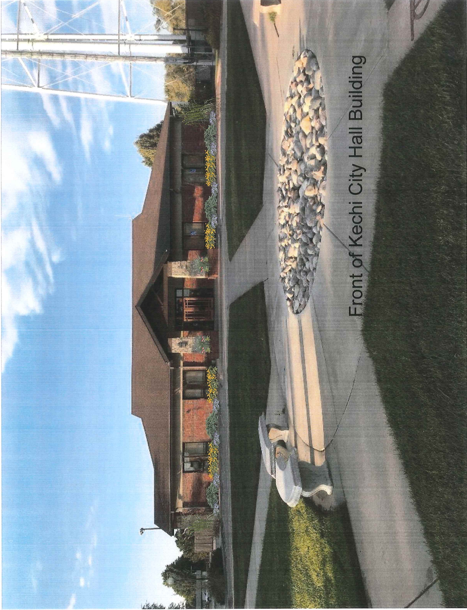
Front of Kechi City Hall Building