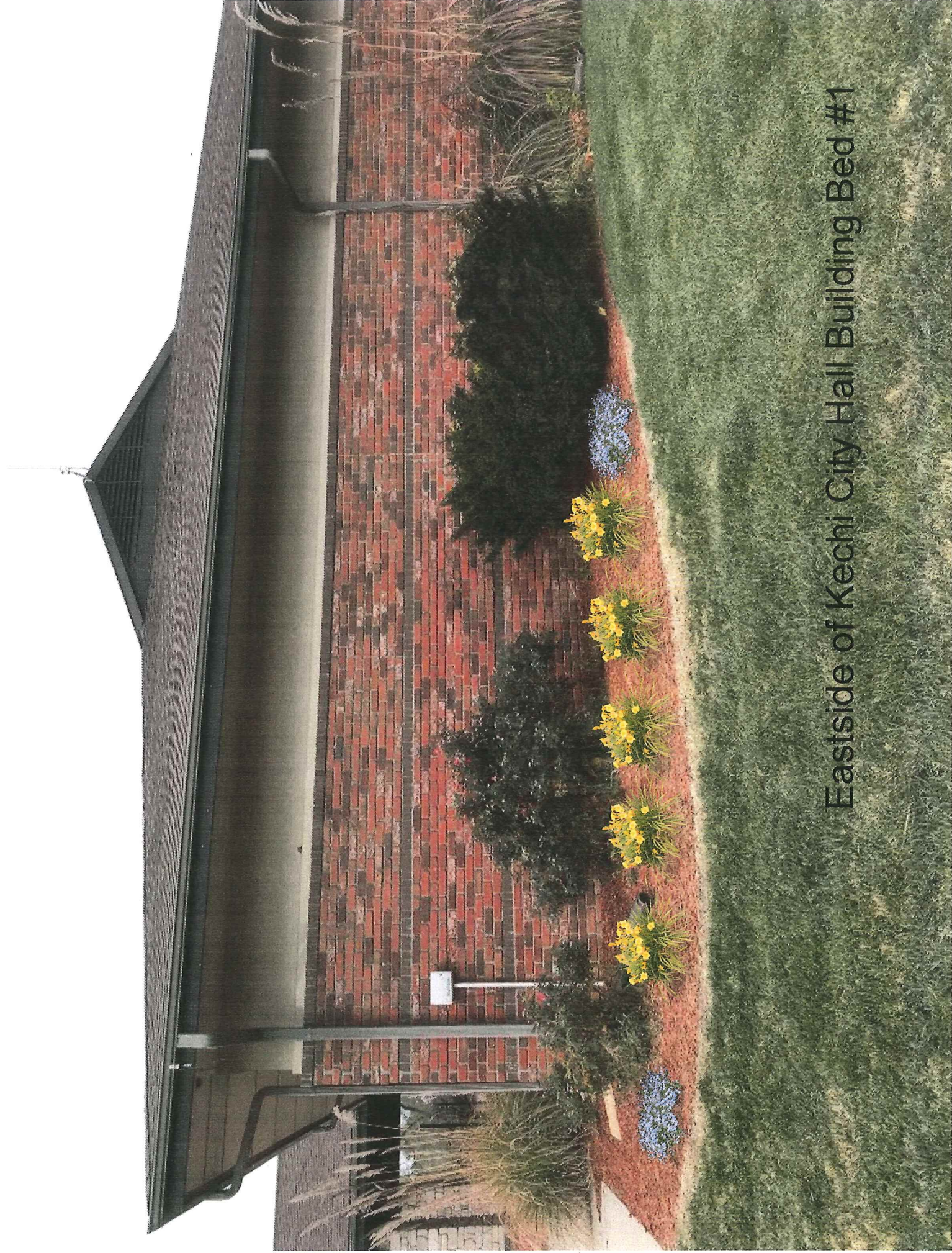
Eastside of Kechi City Hall Building Bed #1