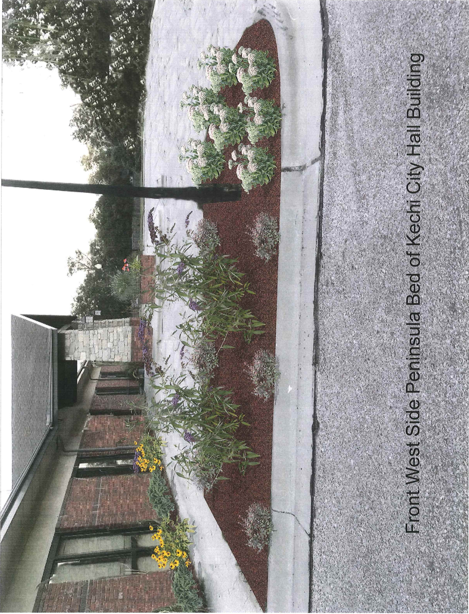
Front West Side Peninsula Bed of Kechi City Hall Building