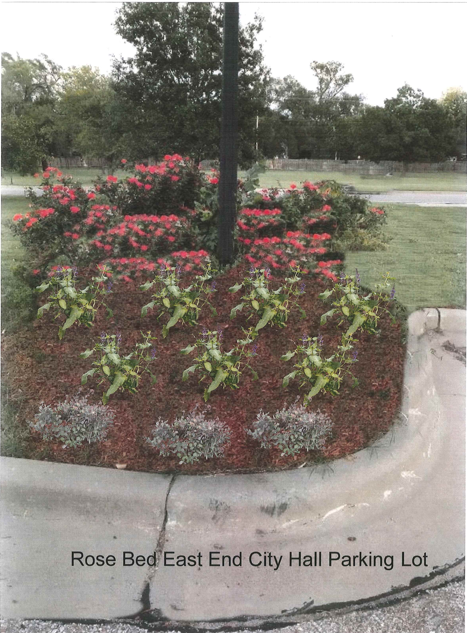
Rose Bed East End City Hall Parking Lot