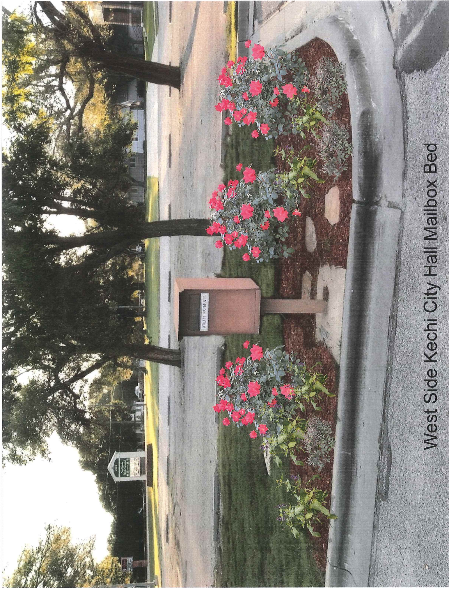
West Side Kechi City Hall Mailbox Bed