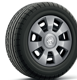
14" STEEL WHEELS WITH HUB COVERS

Electrically adjustable and heated exterior mirrors