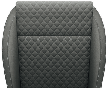
SPORTS SEATS WITH 'DYNAMIC' BLACK FABRIC