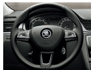
LEATHER MULTI-FUNCTION STEERING WHEEL