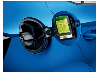
ICE SCRAPER LOCATED IN FUEL FILLER CAP