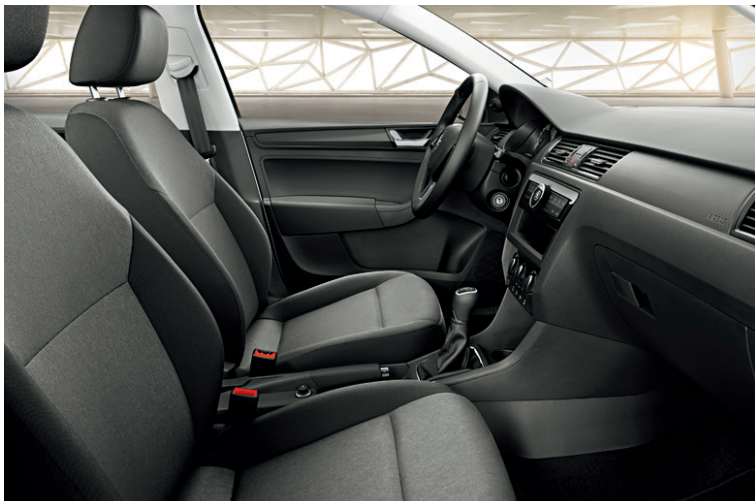
ACTIVE BLACK INTERIOR

The standard equipment of the Active version includes electrically adjustable exterior mirrors, front electric windows, front fog lights and more.