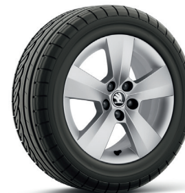
15" MATONE ALLOY WHEELS

Leather gearshift knob/handle Front armrest with storage box Glove compartment light Silver detailing interior package (dials, instruments) Metalic decorative insert on dash board