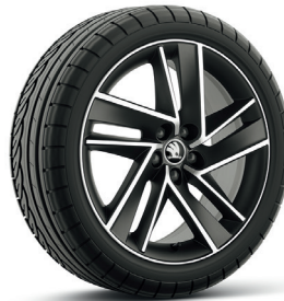
17"BLADE ALLOY WHEELS