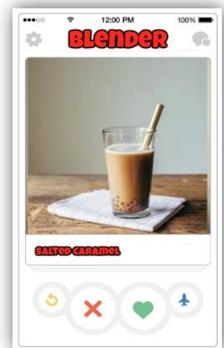
Figure 3: Image of the Boba Blended App's Home Screen

“Blender”, Boba Blended's phone application, created by Nicholas, will notify customers whenever there is a “Hot Deal”. This application will also include the entire menu in a visually pleasing format where customers will be able to scroll through the beverage options (or use the view all function) and “swipe right” for any beverage they wish to add to their shopping cart. Following the swipe will be additives in a similar format that customers can “swipe left” to decline the additive or “swipe right” to add that additive to the order/beverage. This way customers can interact with the application and see the variety Boba Blended