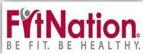
Figure 2: The Logo of Boba Blended's Partnering Gym