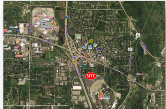
Figure 1: Map Showing Annual Daily Traffic Around Boba Blended's Building

Boba Blended is located on Nations Drive in Gurnee, Illinois. Boba Blended is visible to the traffic of Grand Avenue, a major thru-fare which has about 29,000 average daily traffic, and also I-94, which has about 97,900 average daily traffic. Additionally, nearby stores' popularity, such as Starbucks and Culvers, will help develop Boba Blended's presence in Gurnee. The company is also conveniently located approximately half a mile from Six Flags Great America, which has approximately 2.4 million visitors a year, and adjacent to the overpass that connects to the Gurnee Mills Mall, which has about 23 million visitors a year. 1 By utilizing the company's location and nearby tourist destinations through flyers and signs, the company's message will be delivered through the form of flyers and social media. An example of the opening flyer can be found in the supporting documents section (p. 29).