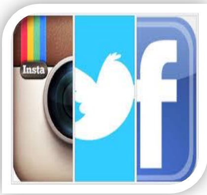
Figure 4: Image of Social Medias Boba Blended Will Use

To engage the community and get the company's key message out there, there will be a community oriented section with a chalkboard. On this chalkboard, frequent customers can sign their name and create a tally of how many times they have been to the store. This method will develop a customer base for Boba Blended and new customers can potentially see friends they have and come back with them in the future. Also, the chalkboard will engage social media. Customers will be encouraged to tweet out or snapchat their name on the chalkboard, allowing Boba Blended to connect with the community on a personal level. Another part of the community oriented section is the business cork board. On this cork board, businesses can post job fairs, employment opportunities, and other relevant local information.