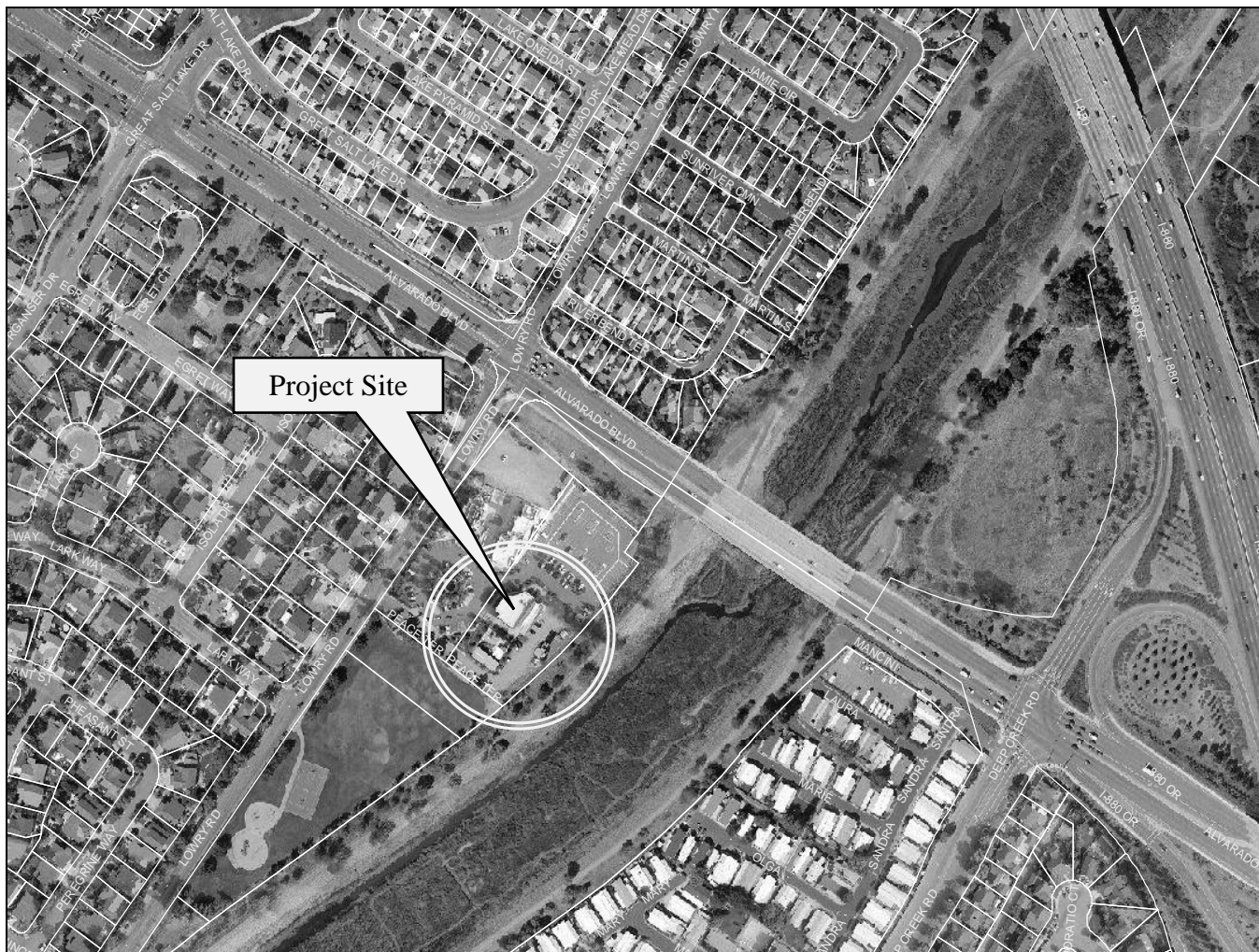
Figure 1: Aerial Photo (2009) of Project Site and Surrounding Area.