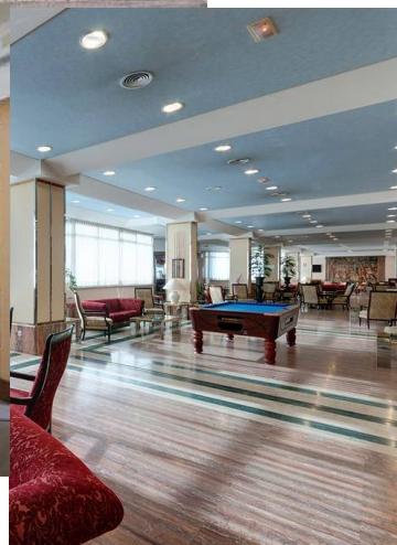
Tryp Melia Guadalajara Hotel