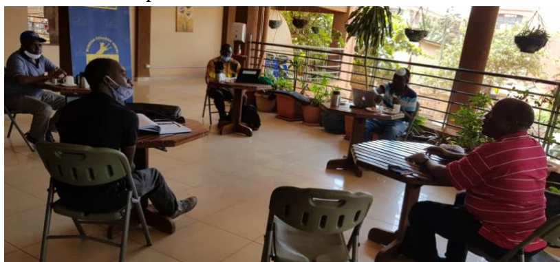
the SPC and MEXCOM discussing the Draft SP

The development of this strategic plan went through various participatory stages. The committee reviewed some documents related to MWICO, other Investment Clubs, SACCOS, and also held consultative meetings with MEXCOM. In addition, on the Mwiri Investment Forum, the members discussed and provided guidance on what investment club they wanted and this informed and defined the strategic direction for MWICO over the next five years. Based on the above processes, this strategic plan (SP) was developed including funds mobilisation strategies, which was shared with MEXCOM for their feedback so as to ensure that the document captures their aspirations. Due to Covid-19 pandemic restrictions, a revised draft after incorporation of comments from MEXCOM was produced and circulated to the members online for any additional input. This final