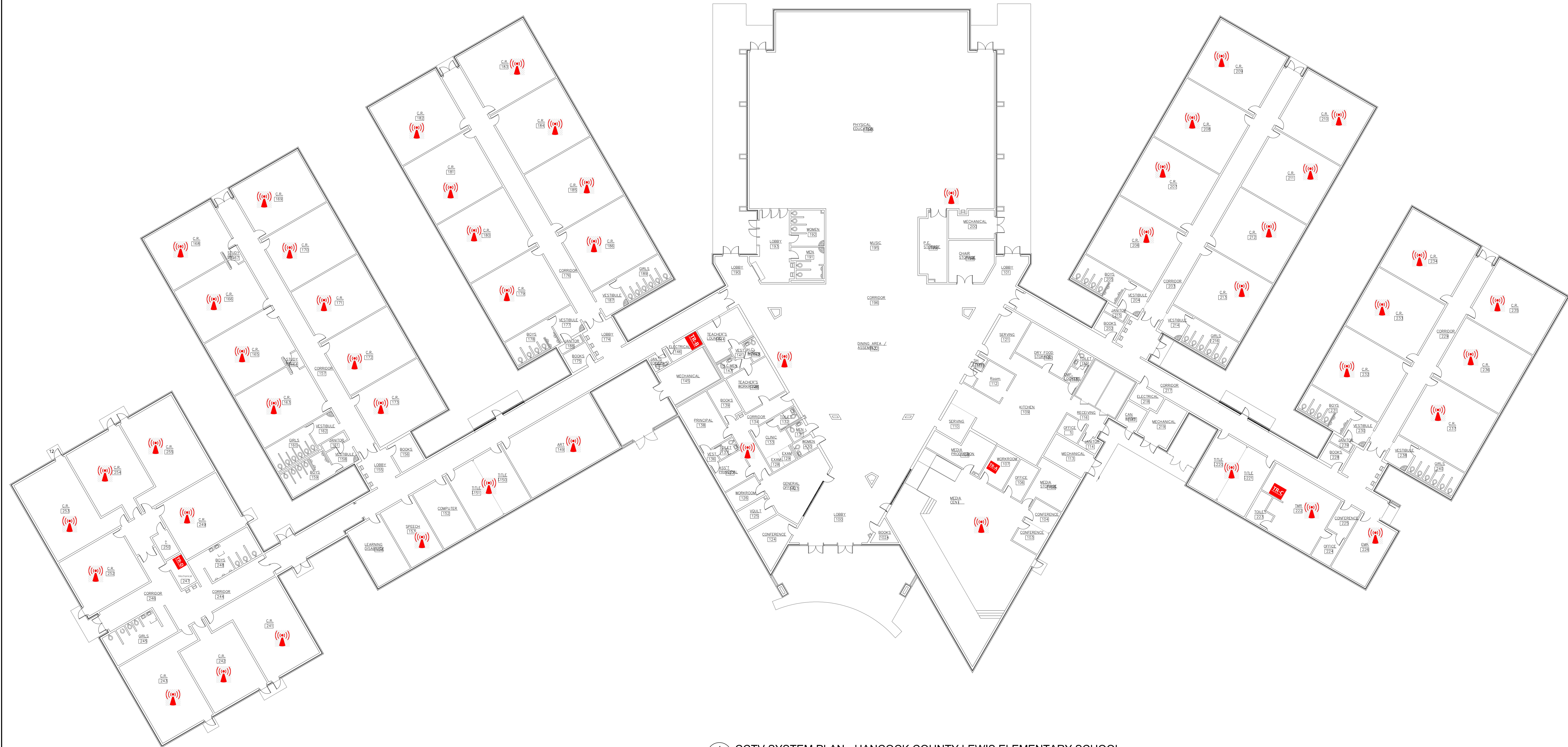
1 CCTV SYSTEM PLAN - HANCOCK COUNTY LEWIS ELEMENTARY SCHOOL E2.1 SCALE: 1/16"=1'-0"