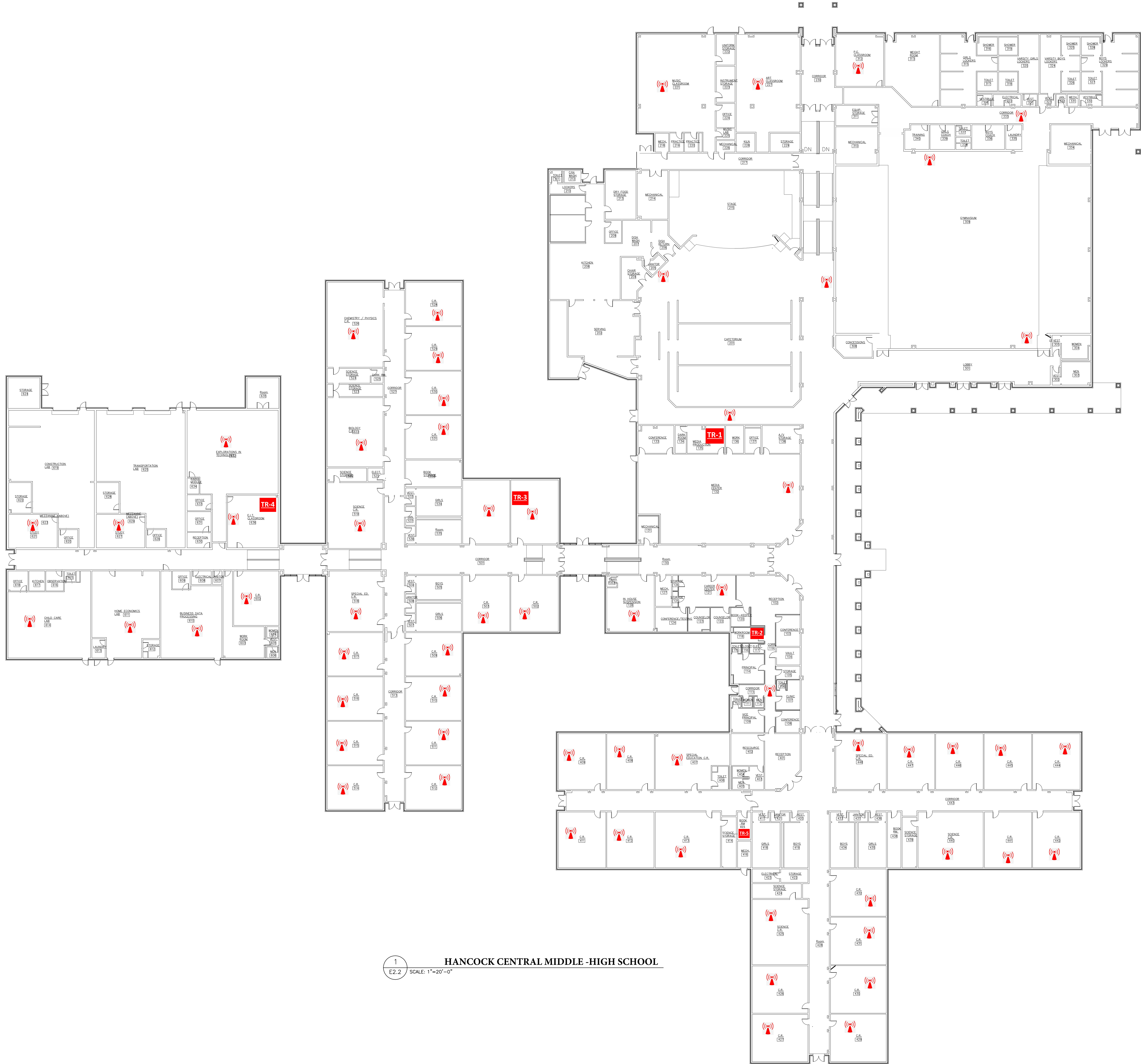
1 E2.2 HANCOCK CENTRAL MIDDLE -HIGH SCHOOL SCALE: 1"=20'-0"

WARNING: Contractors, subcontractors, vendors and suppliers are advised that the contract documents consist of all drawings, specifications, and addenda. It is the responsibility of the contractor to obtain and review all contract documents prior to construction. The contractor shall be responsible for obtaining and reviewing all contract documents and for ensuring that the construction is in accordance with the contract documents. The contractor shall be responsible for obtaining and reviewing all contract documents and for ensuring that the construction is in accordance with the contract documents.