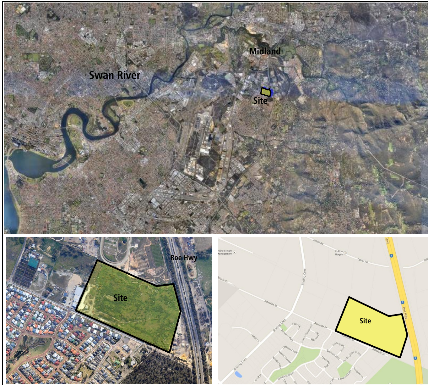
Fig 1- Site and Regional View, Lot 20 Adelaide Street, Hazelmere