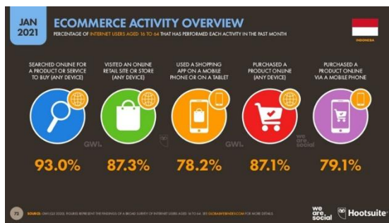
Picture 2. Ecommerce Activity overview

increase of approximately 78000 merchants joining the GoFood service. On the other hand, GrabFood reaches Eighty-three trillion rupias while GoFood reaches Rp. 28 trillion. This record is also supported by the databox of the Demographic Institute of the Faculty of Economics and Business, the University of Indonesia, which states that it spent 97 percent on food orders, 76 percent on delivery services, and 75 percent on transportation during the COVID-19 epidemic. From the data above, it can be seen that during the COVID-19 pandemic, there was an increase in users/purchases of food online.