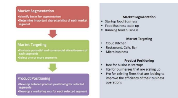
Picture 3. STP rumahmakan.online

Based on these opportunities, Segmenting, Positioning, and Targeting analysis is carried out for the basis of the marketing strategy to be made and as one of the considerations for determining the subscription price range.