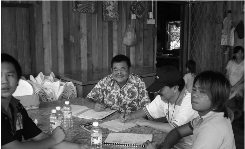
Small holder farmers in Malaysia collecting farm data input costs.

This COP analysis includes finance costs on borrowed money. It is the choice of the farm business adviser as to whether interest on loans is included as a cost of producing milk on Asian small holder farms. Because they can constitute a major cash outlay each year for SHD farmers, they should be included in his annual financial commitments and future farm budget projections. Consequently, they have been incorporated into this particular COP analysis. This decision highlights the importance of clearly describing the particular components of any financial analyses so the reader is clear as to exactly what is and what is not included in the final 'bottom line' measure of COP.