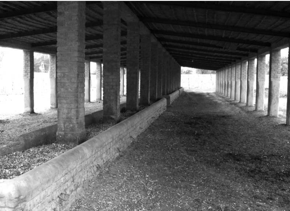
Brick pillars and roofs are economic in Pakistan.

SHD farmer when deciding on today’s livestock feeding program, next week’s crop agronomy program or the optimal herd size for next year’s likely farm gate milk price. Such decisions are based on the elementary frameworks of farm business management.