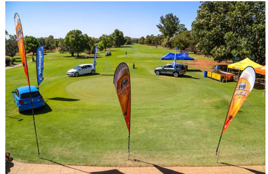
B&C Plumbing Pty Ltd (Lic no 51025C) Charity Pro Am