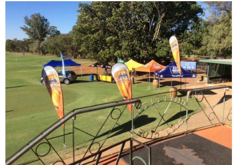
B&C Plumbing Pty Ltd (Lic no 51025C) Charity Pro Am