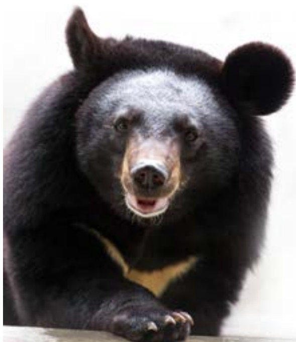
Animals Asia Foundation Head Office Room 1501, Tung Hip Commercial Building, 244-252 Des Voeux Road Central, Sheung Wan, Hong Kong