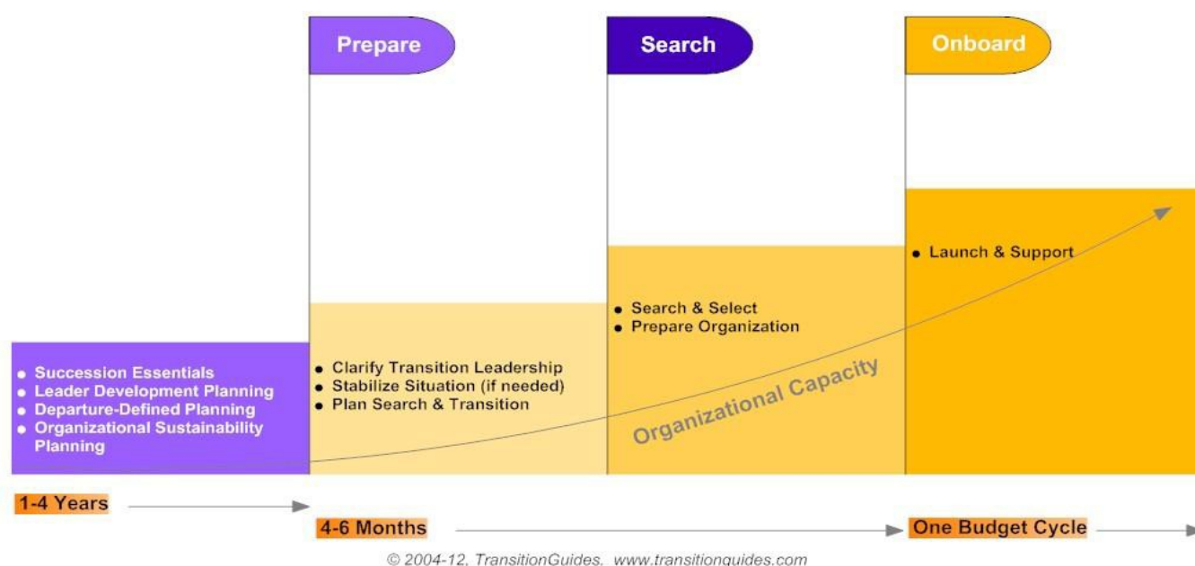
Figure 1 - The three phases of Executive Transition Management:

ETM is more than an executive search; it's a way of managing the entire turnover and handoff process in a manner that builds the capacity of the organization. The ETM process is based on a three-phase model for managing the entire departure, search, selection, hiring, and onboarding process. ETM takes the board from early-stage thinking about executive succession through the successful launch of the incoming executive.