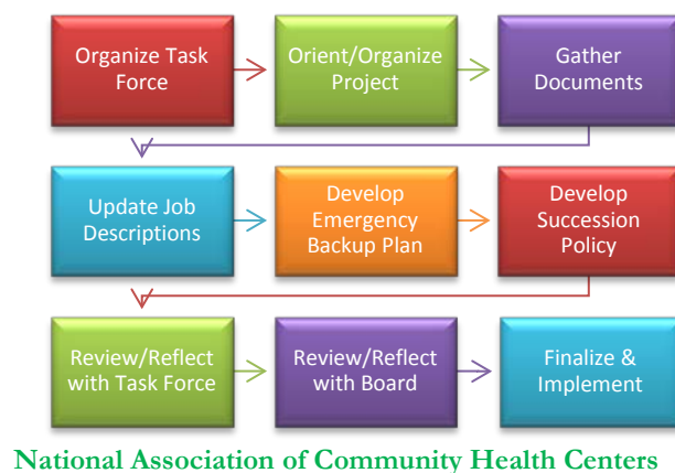
Figure 1 - Process overview for implementing succession essentials

This section describes the process of developing succession essentials as a process unto itself. The next section describes how to combine work on succession essentials with a sustainability review. If your organization has a long tenured or founder executive or a relatively new executive, the combination of succession and sustainability planning is recommended.