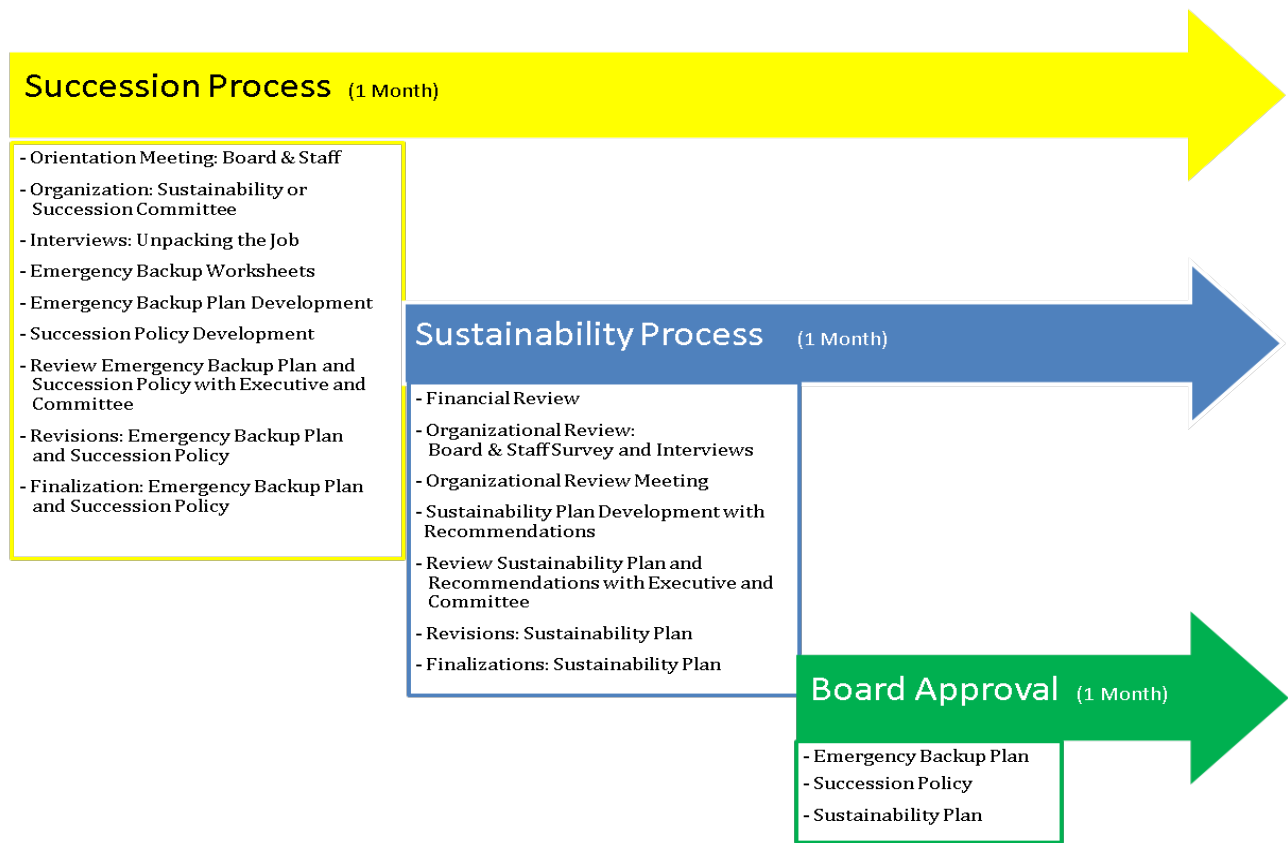
Figure 3 – Sustainability and Succession Planning Process (Sequential Process)