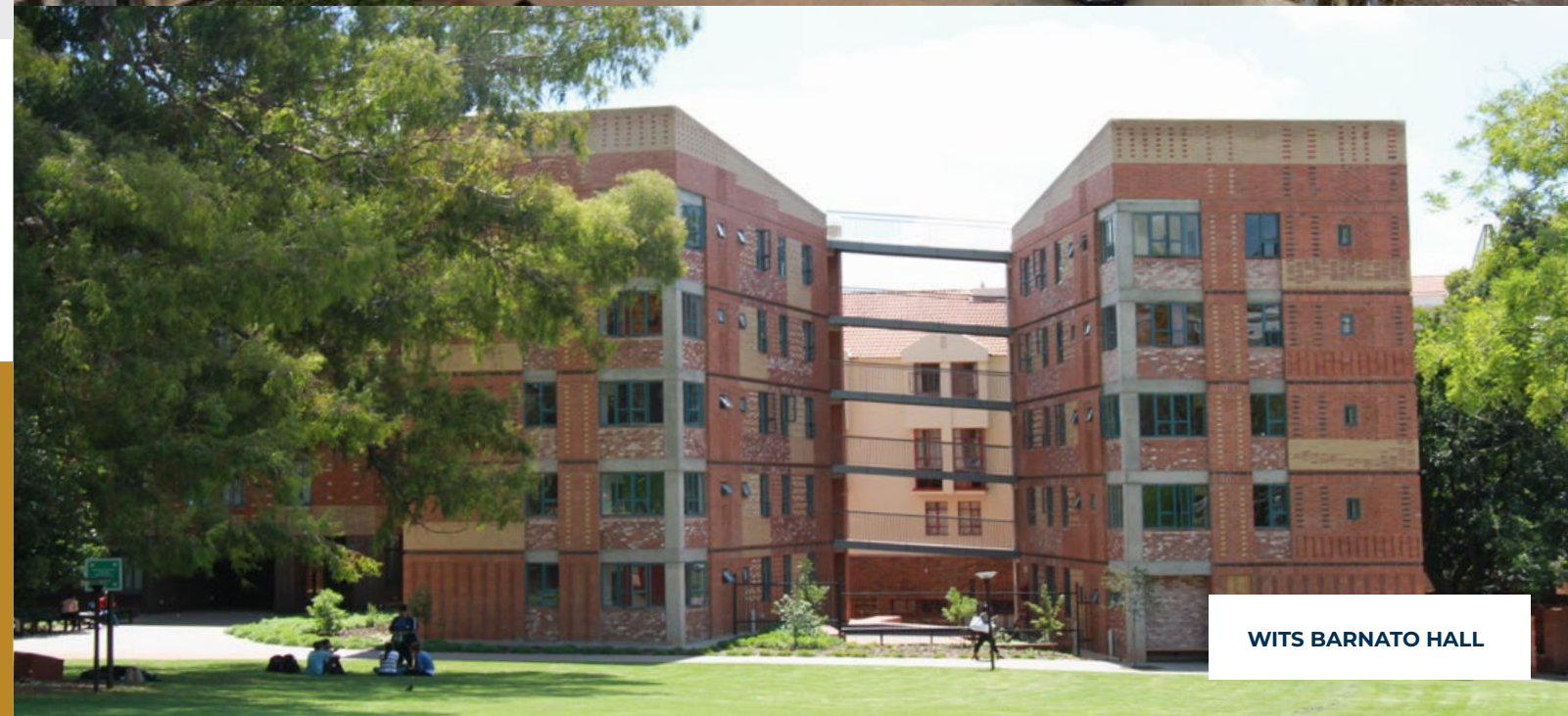
WITS BARNATO HALL