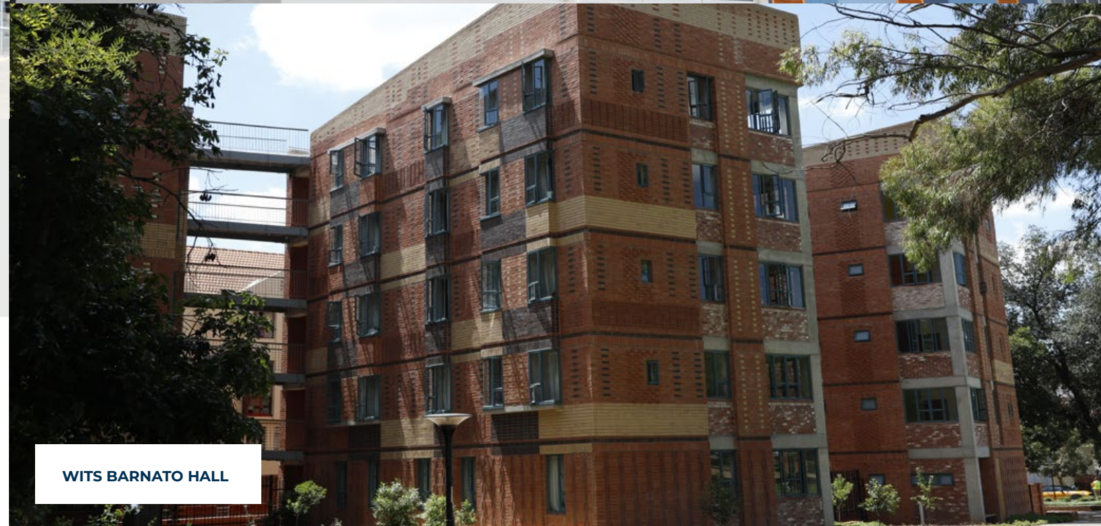
WITS BARNATO HALL