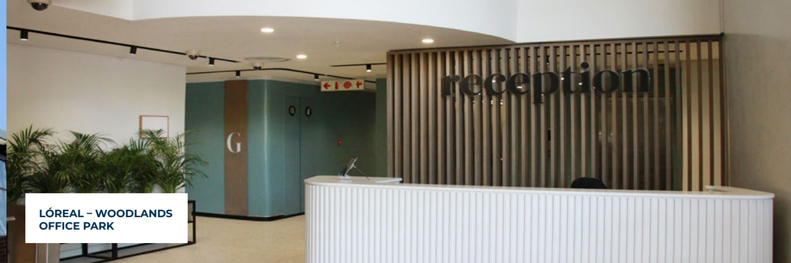
LÓREAL – WOODLANDS OFFICE PARK