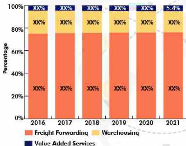
Indonesia Logistics Market Future Projections by Service Mix (Freight Forwarding, Warehousing and Value Added Services) on the Basis of Revenues in Percentage (%), 2016-2021

Source: Interview with Indonesia Logistics Industry Professionals, Ken Research Analysis