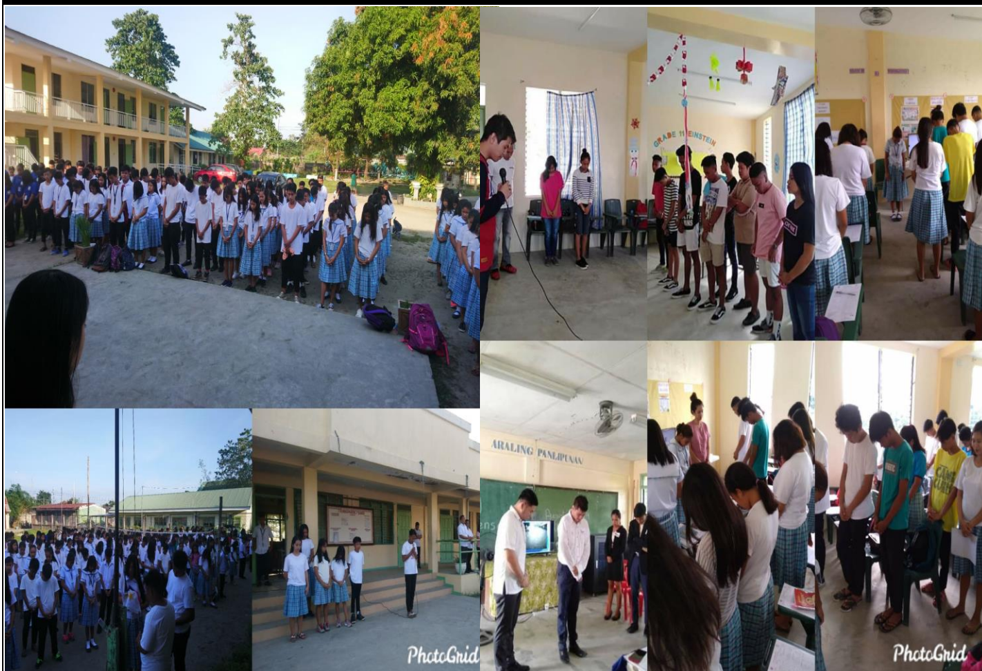
Praying before the Flag Raising Ceremony and before the class starts.