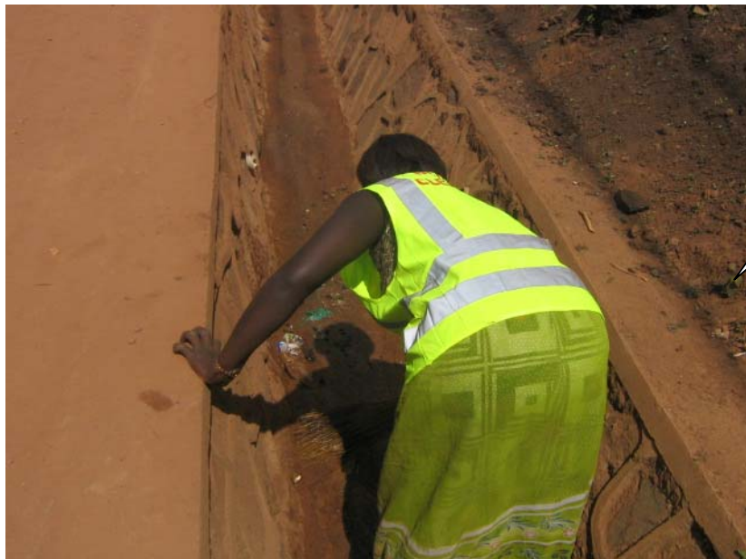
One of workers cleaning the gutters in Kololo