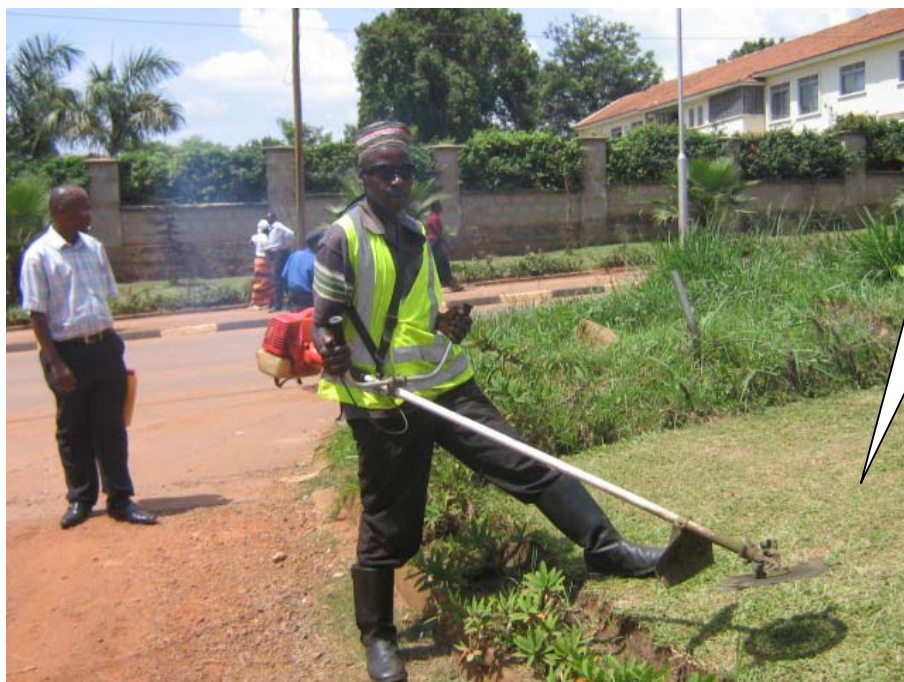
One of the workers slashing in Kololo (Wampewo Avenue)