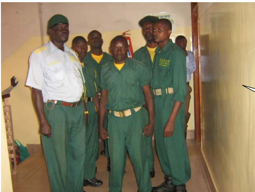
A cross section of our Enforcement officers