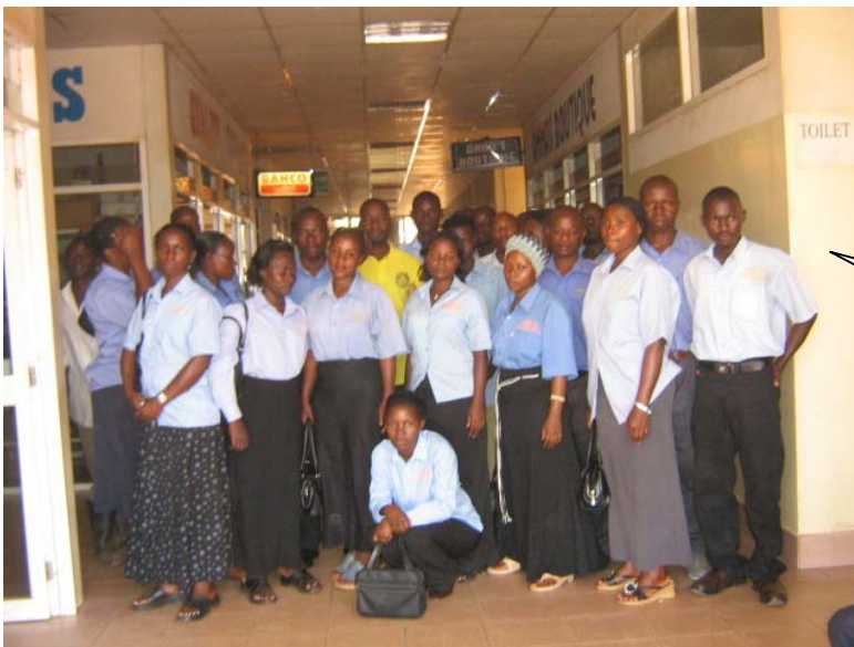
A cross section of our revenue collectors