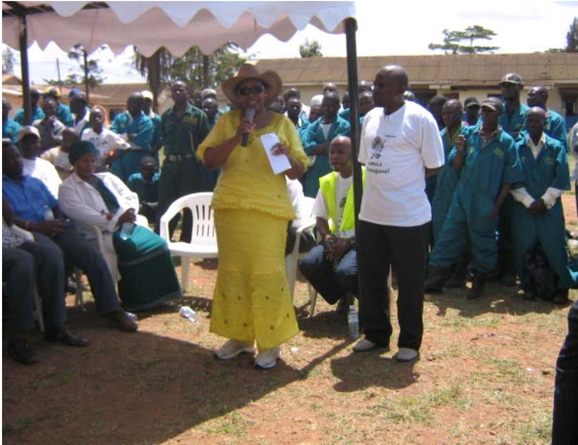
Honorable Minister of state for Local Government, Hope Mwesigye Launching "CHOGM Kampala Etemagane" at Nakivubo Settlement Primary school.