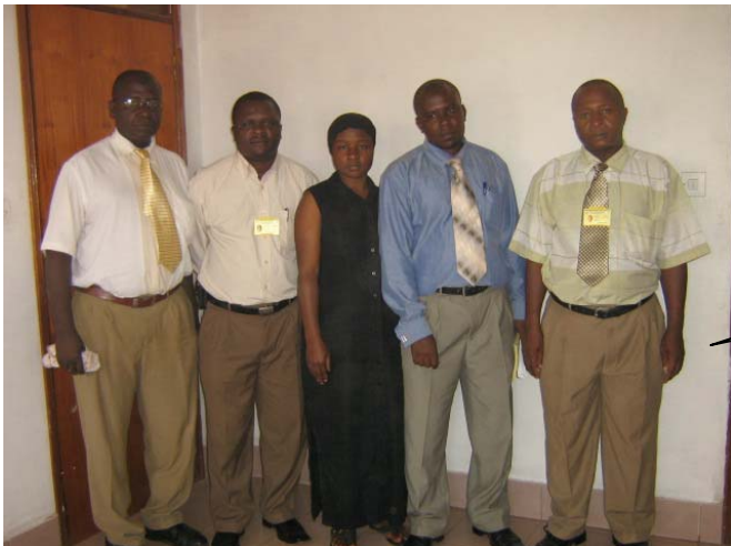
A cross section of the management team