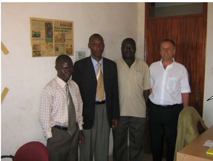
Some of the NUJV management team and the