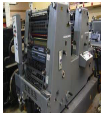
Offset Printing Press