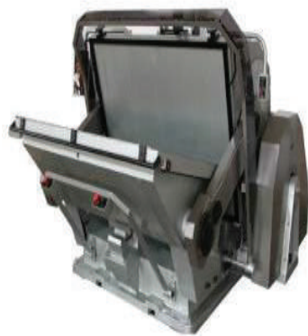
Offset Printing Press