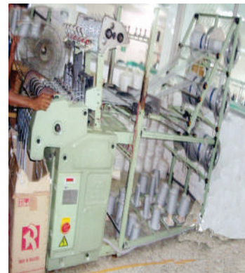
Twill Tape Unit