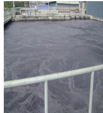
Effluent Treatment Plant