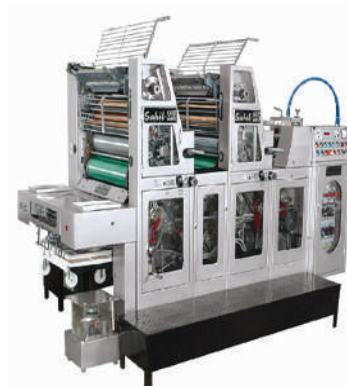
Offset Printing Press