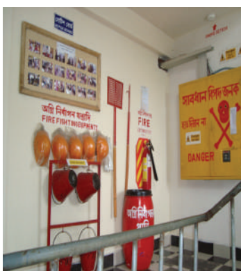
Fire & Safety