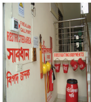
Fire & Safety