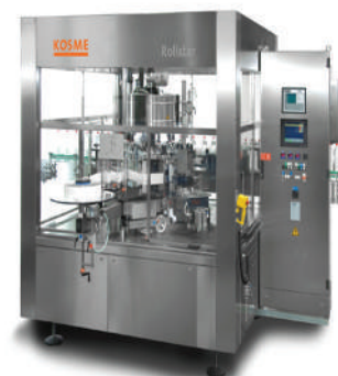
Offset Printing Press