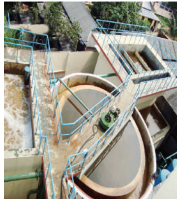
Effluent Treatment Plant