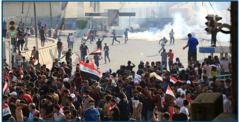
Security forces attempting to disperse protestors in Tahrir Square, Baghdad, with tear gas and live ammunition.

From the end of the September 2019, reports were received of protests being organised on social media, planned to be conducted in Tahrir Square, central Baghdad. This reportedly provoked the deployment of security forces to the area in preparation for demonstration activity. Over the next 24 hours, over 1-2 October, a significant escalation of protest activity was observed across major urban centers in the country, including Baghdad, Hillah, Najaf, Kut, Samawah, Nasiriyah and Amarah. In Baghdad, thousands of people gathered in the city's central districts,