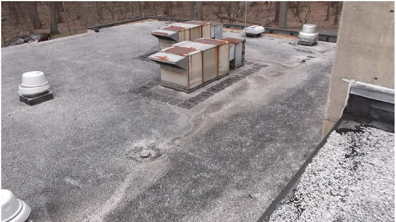
Vocational High School Roof and HVAC systems. EXHIBIT 'D'