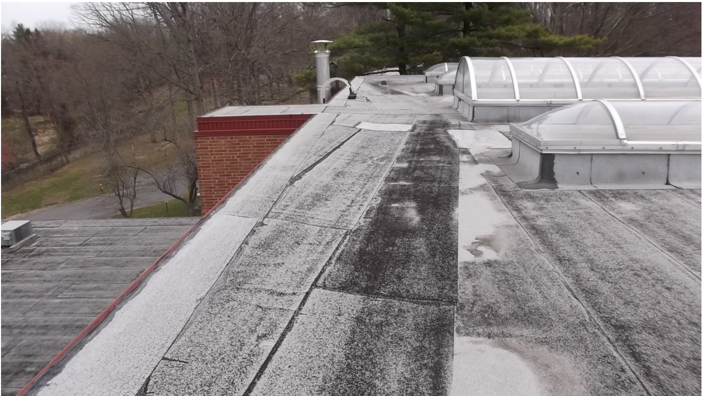
Academic High School Gymnasium Roof and Skylights. EXHIBIT 'D'