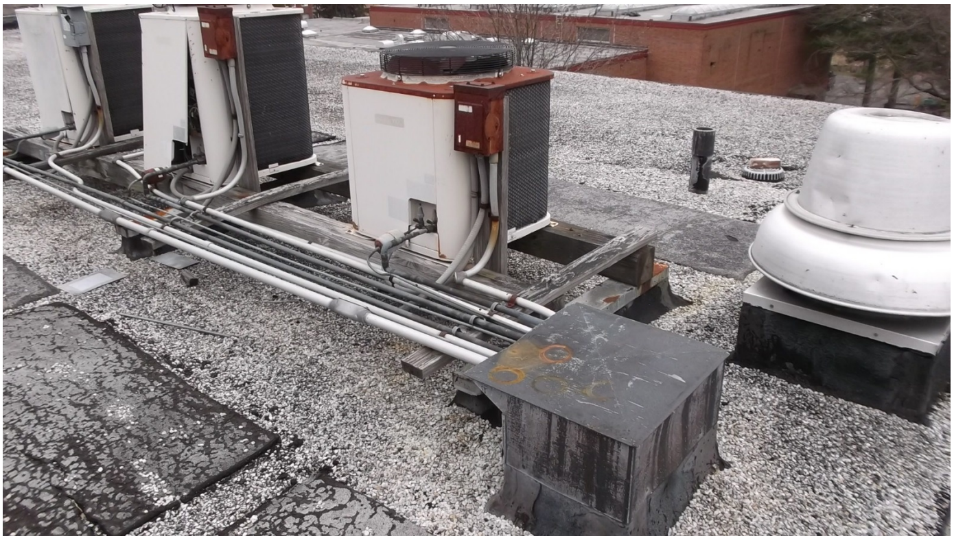
Vocational High School Roof and HVAC systems. EXHIBIT 'D'