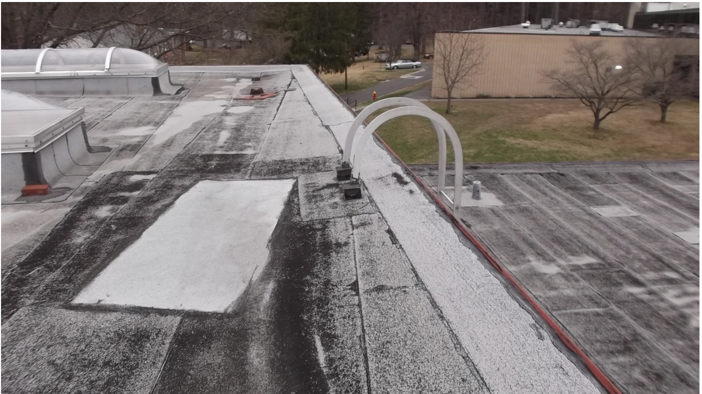
Academic High School Gymnasium Roof and Skylights. EXHIBIT 'D'