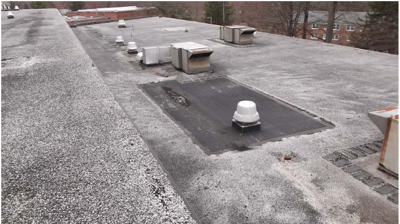
Vocational High School Roof and HVAC systems. EXHIBIT 'D'