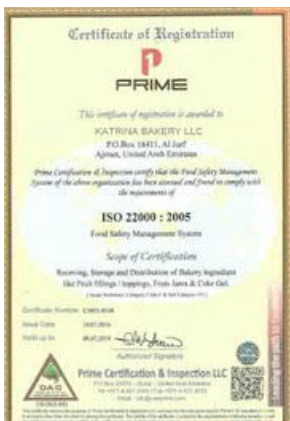
ISO 22000:2005 certificate

The factory is located at Dubai Investment Park 2 (DIP-2) industrial cluster, close to main roads with fast access within 1-1.5 hours to Abu-Dhabi, Sharjah, Ajman, Al Ain Emirates.