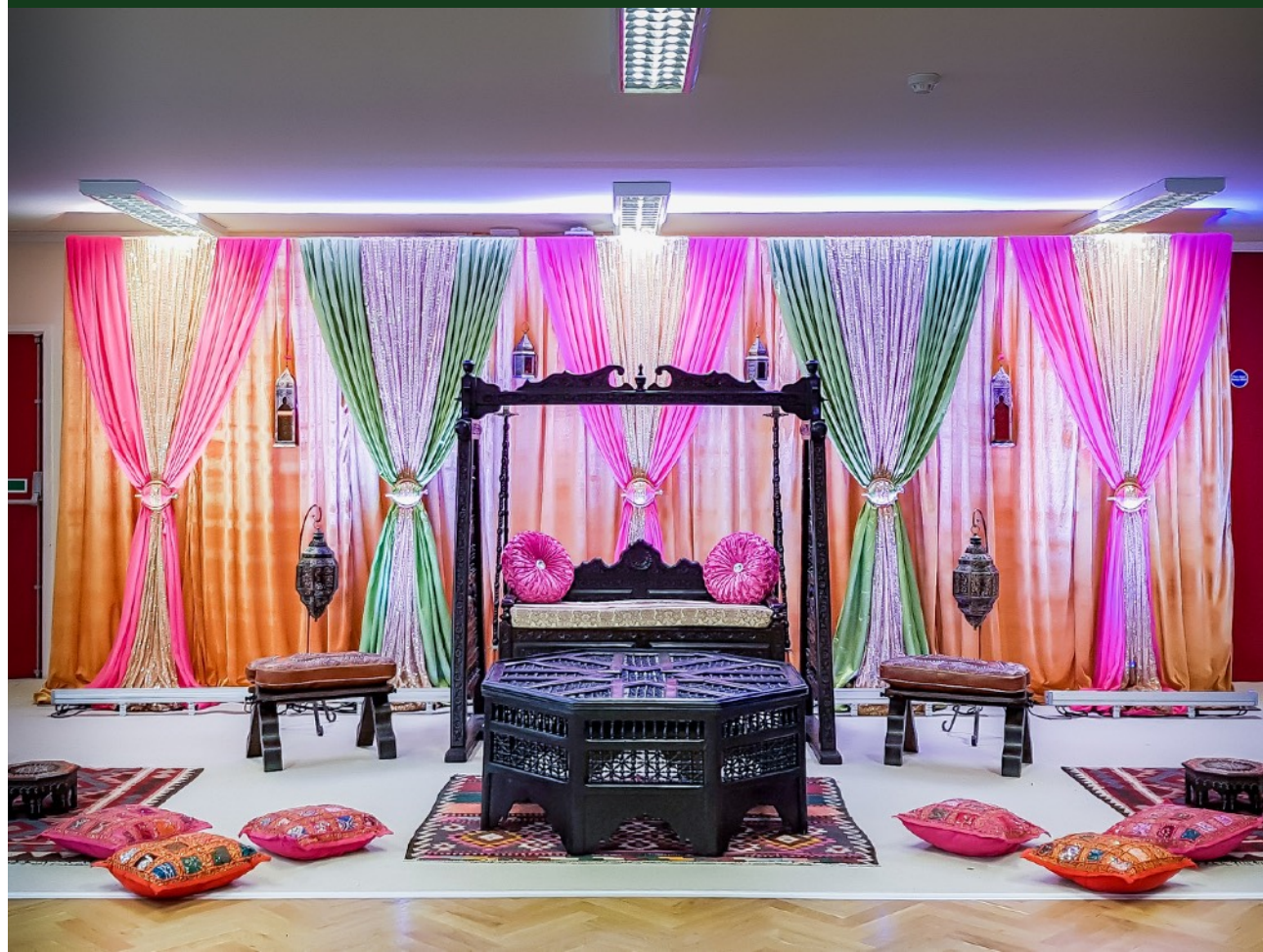
Table settings Wedding planning Wedding stage setting On-site preparation Full managed catering service

From birthday parties to weddings, anniversaries to ethnic celebrations, our team is sure to guide you through the food selection, concept that meets your requirements and budget. Every detail will be taken care of, thus making your event a memorable one for yourself and the guests. Our services extend to: