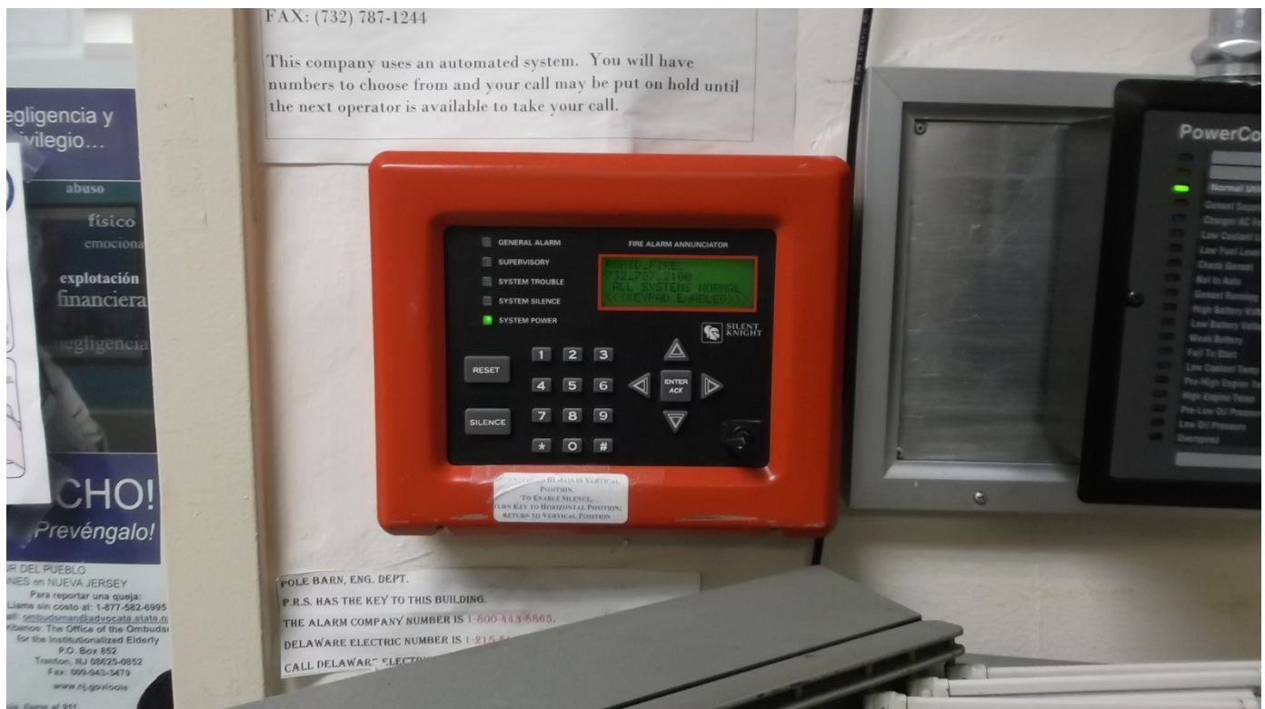
Main annunciator panel at HSR Building.