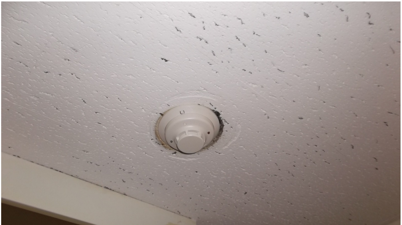
Typical non-addressable device to be replaced.