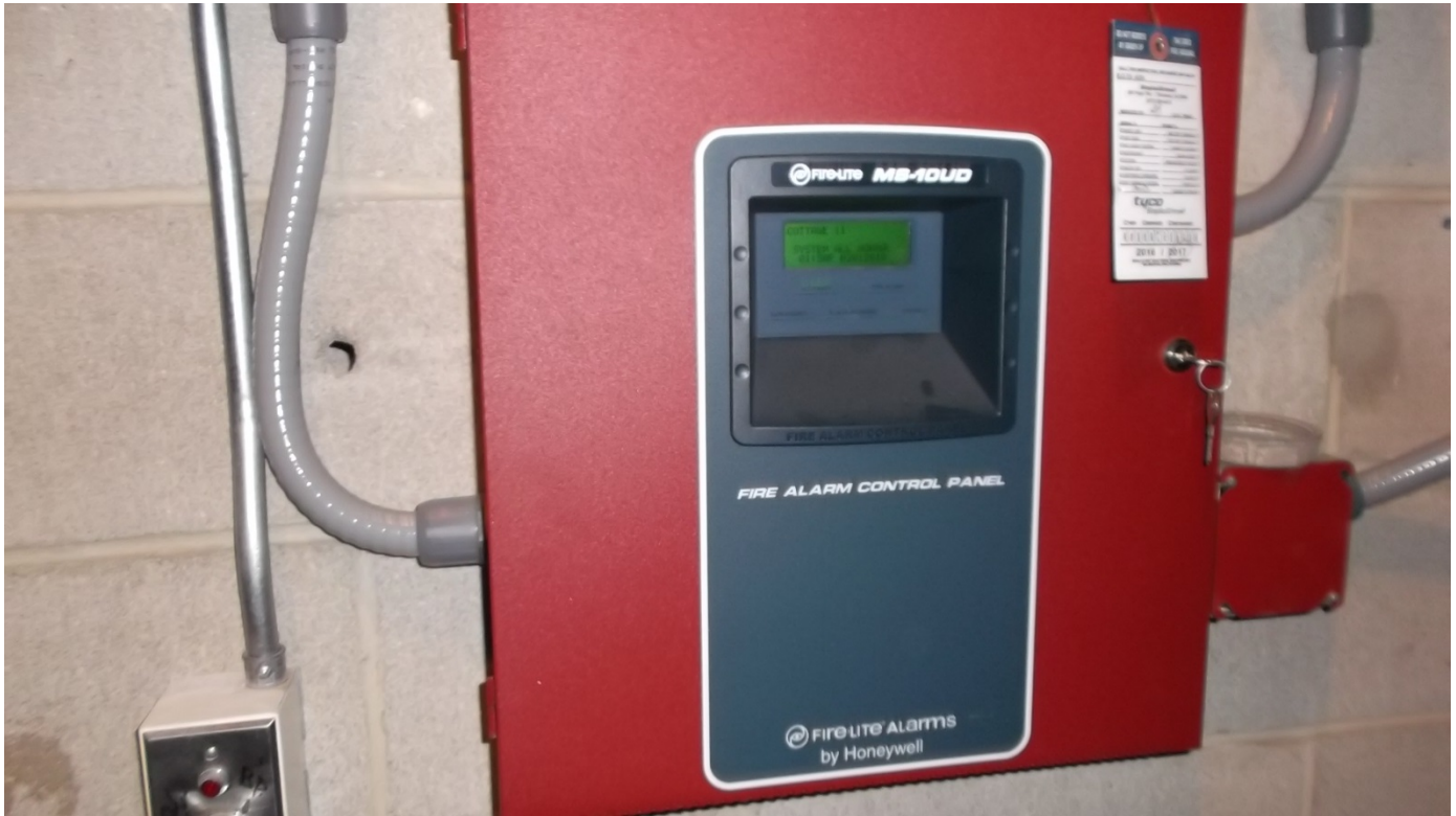
Typical Cottage zone fire alarm panel to be replaced.