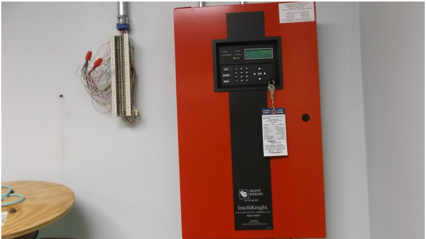
Main panel at HSR Building.