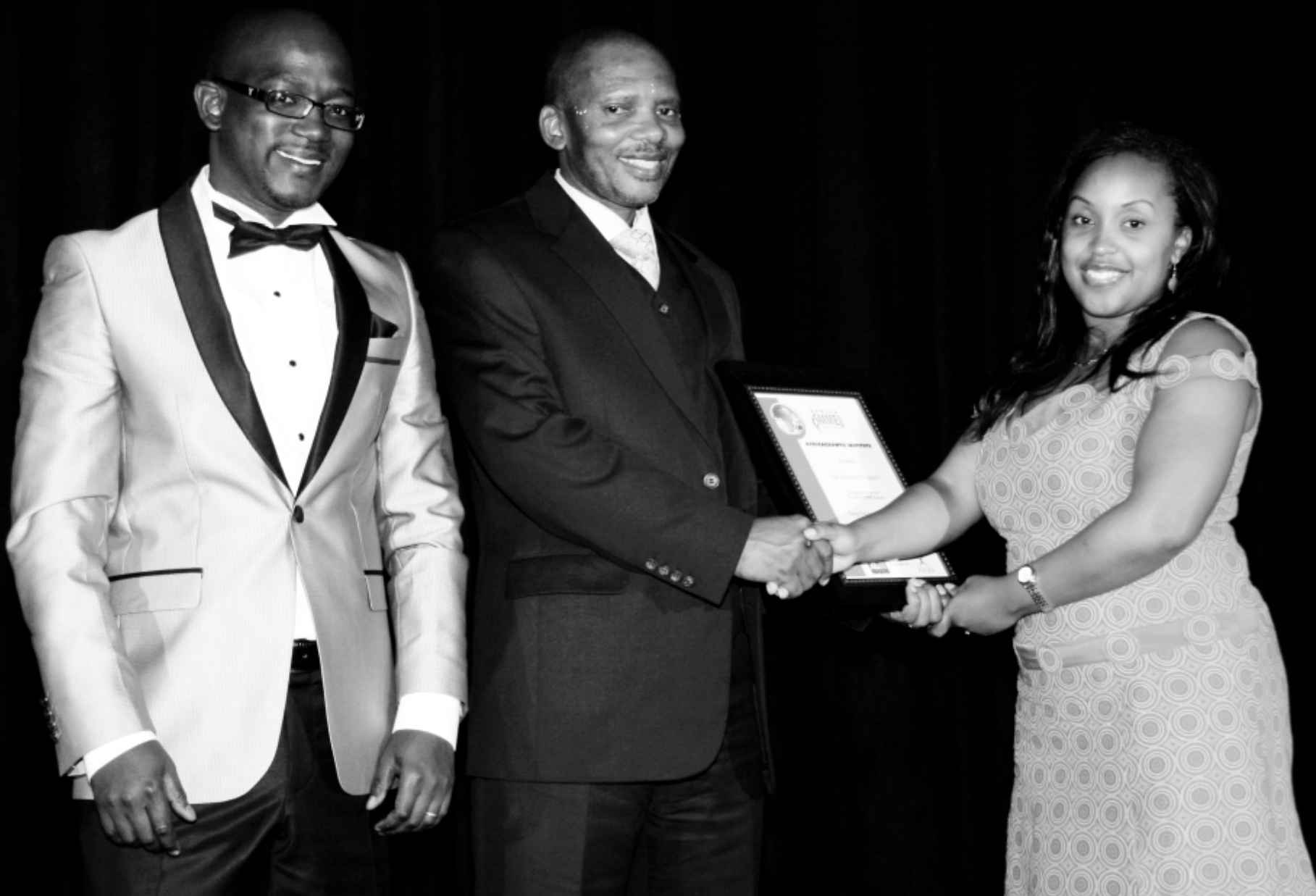
Young Enterprise Africa, Fifth Annual Africa SMME Awards Cape Town, South Africa