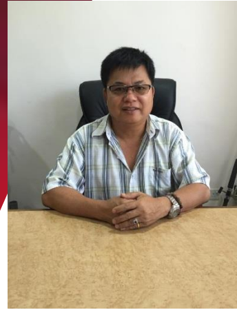
"Founder of the Company"