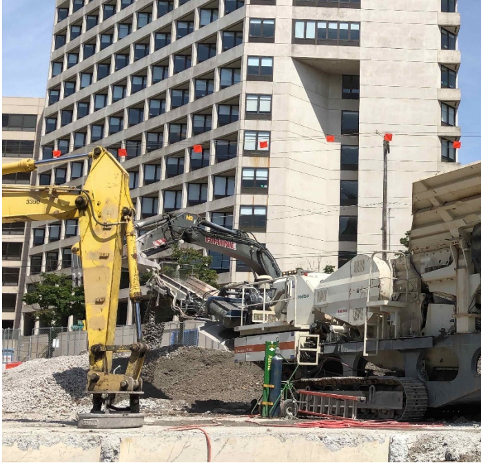
Crushing and Sorting Remainder of Rebar from Rubble Material