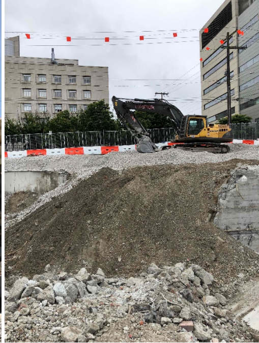
SE Corner Remainder Wall Excavated