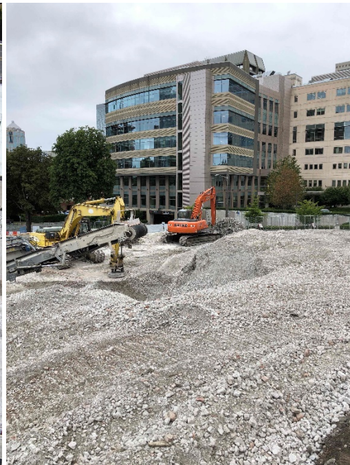
Spreading of Crushed Rock Along SE Bench for Drilling Rigs