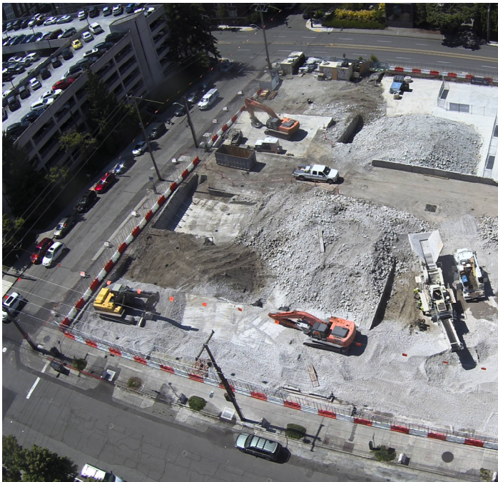
Block 95 – View from Web Cam