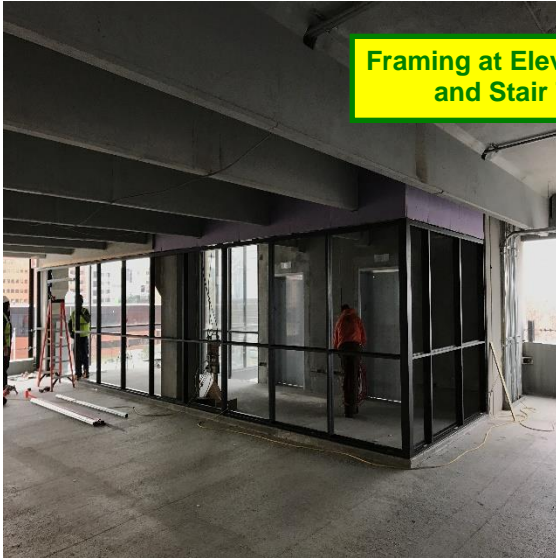
Framing at Elevator Lobbies and Stair Tower 3