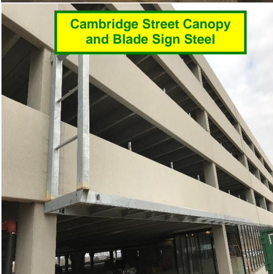
Cambridge Street Canopy and Blade Sign Steel