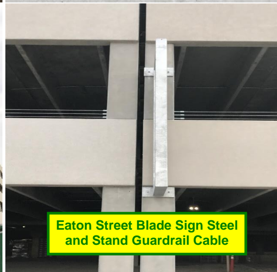
Eaton Street Blade Sign Steel and Stand Guardrail Cable