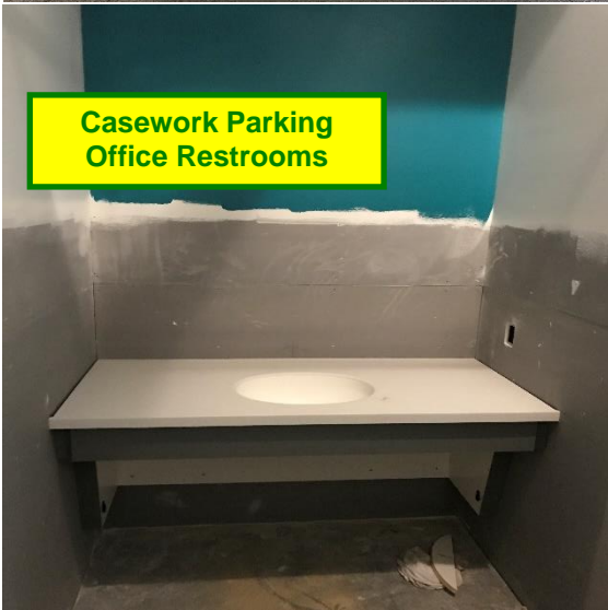
Casework Parking Office Restrooms