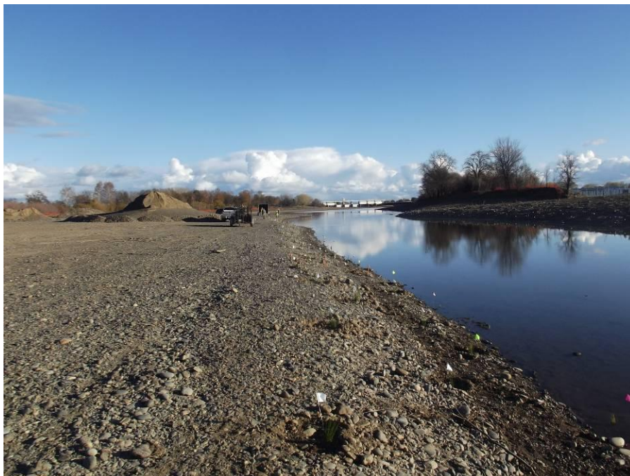
Red Bluff Diversion Dam, Fish Passage Improvement Project, Terrestrial Mitigation The contractor's crew planting the containerized plants at the emergent marsh area between stations 10+00 and 15+00

December 2012 "Doing It Right from the Start"