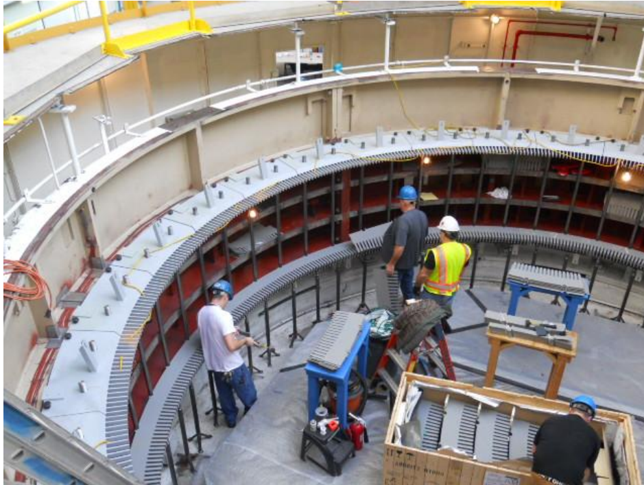
Folsom Power Plant Generators U1, U2, and U3 Rewind and Excitation System Replacement Andritz Hydro workers inside the stator