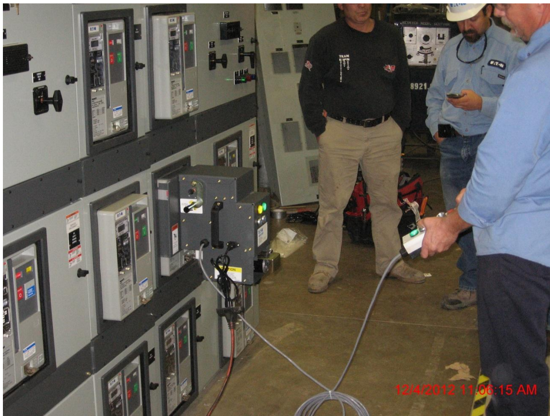
Station Service Switchgear Replacement Eaton electricians testing the remote breaker racking device on a spare breaker in the switchgear

Cal Inc: Workers removed asbestos wire from Control Panel CSA and removed a lead paint coated buss duct. They transported all removed hazardous material from the site.