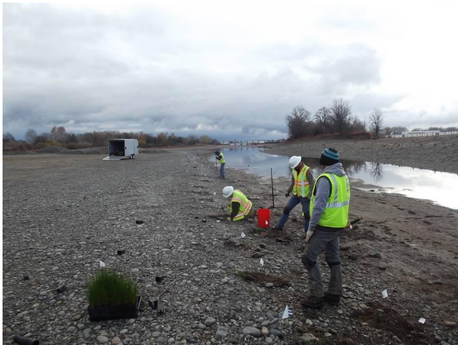
Red Bluff Diversion Dam, Fish Passage Improvement Project, Terrestrial Mitigation The contractor's crew planting the containerized plants at the emergent marsh area between stations 10+00 and 15+00

Tehama Environmental Solutions, Inc. crew worked on raking and removing the small vegetation from the southern island in preparation for the hydro-seeding operation.