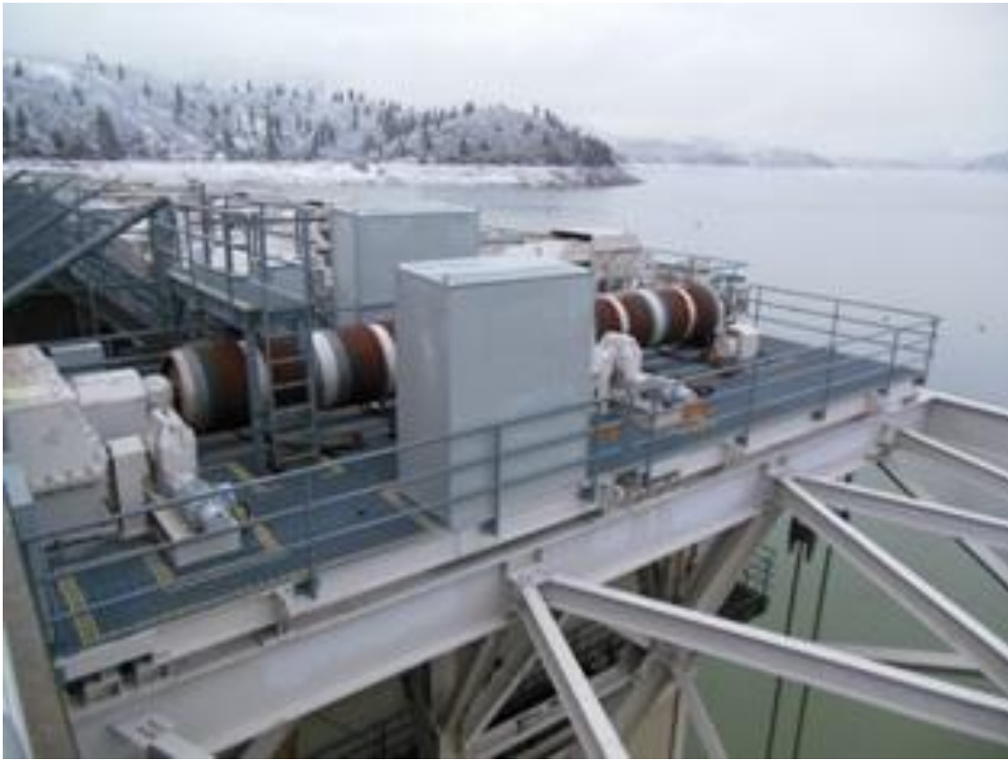
Shasta Dam Temperature Control Device Wire Rope Replacement Side gates from which cables were removed