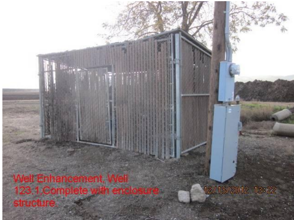
Drought Relief, Well Enhancements West Stanislaus Irrigation District Well 123.1 Completed