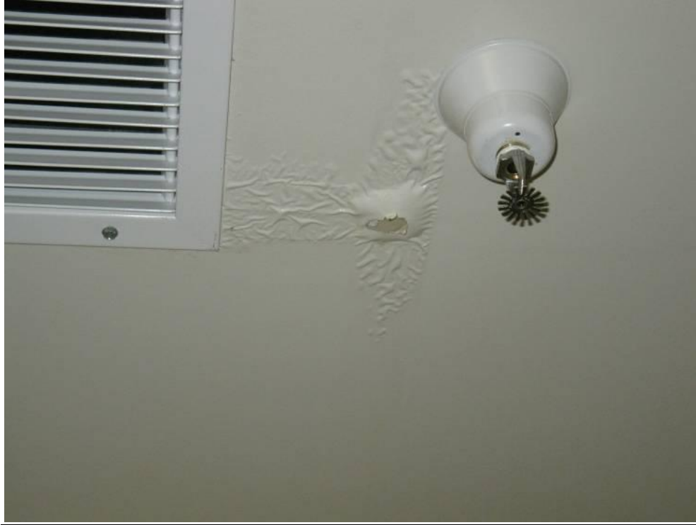
Folsom Dam Civil Maintenance Building Water damage from rain fall in the paint storage room