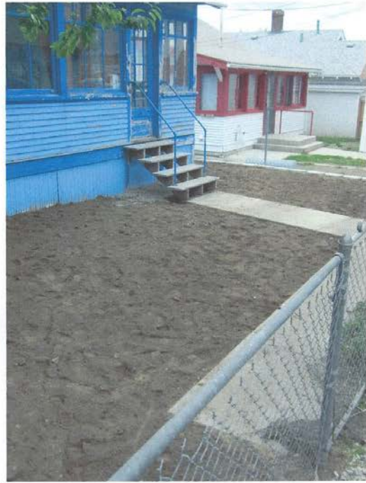
1035 Placer ( During)