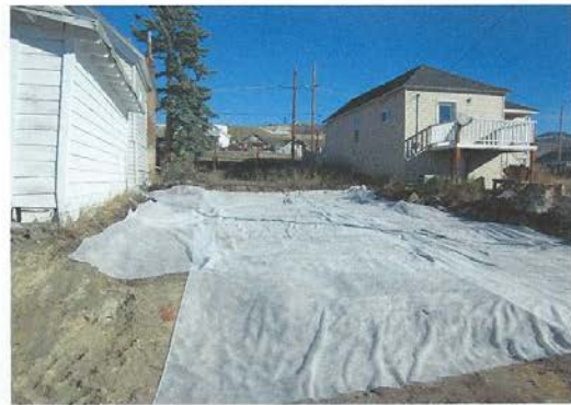
358 E. Mercury ( During)