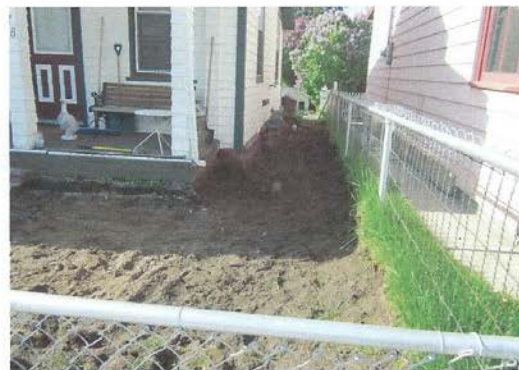
1228 Farrell ( During)