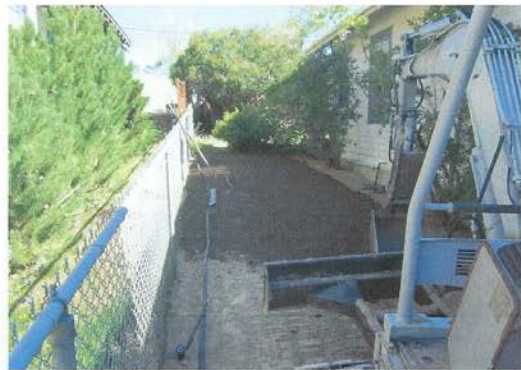
1043 Porphyry ( During)