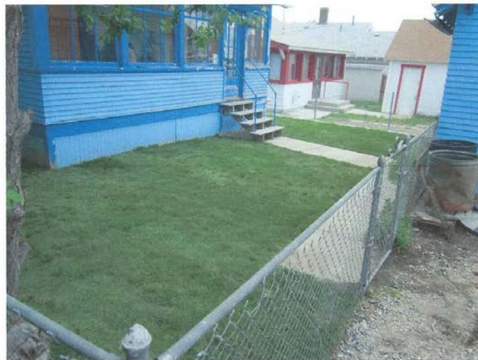
1035 Placer ( After)