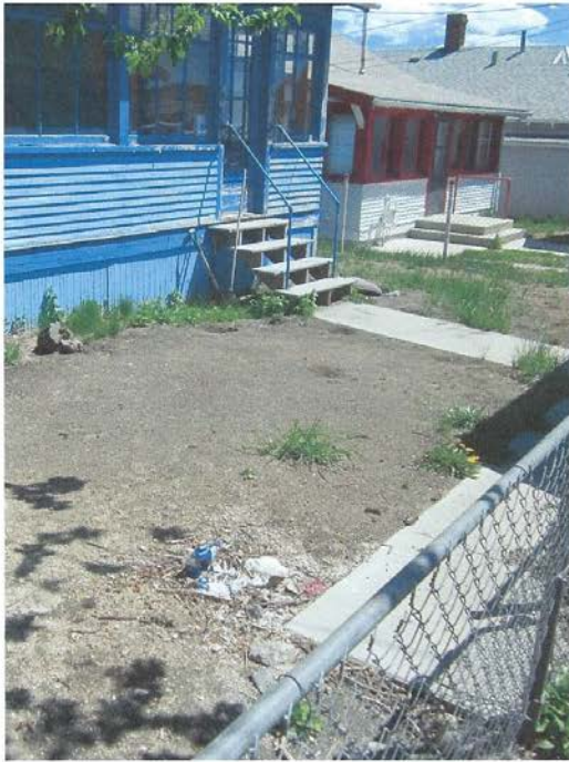
1035 Placer ( Before)