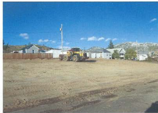
Curtis St. SWS ( During)