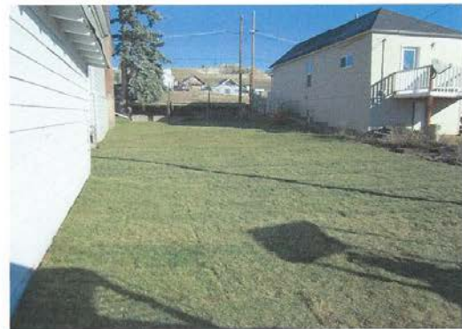
358 E. Mercury ( After)