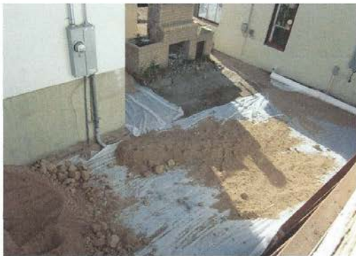
301 W. Granite ( During)