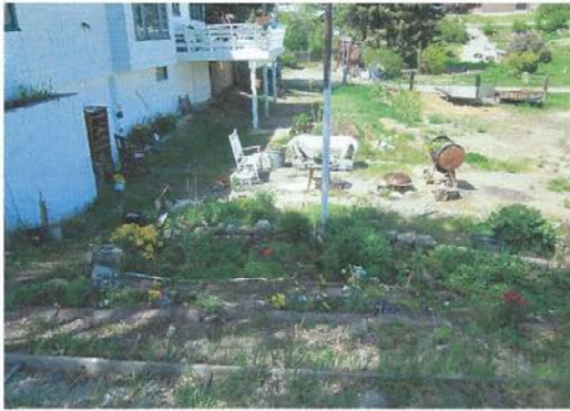
1033 W. Mercury (Before)