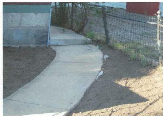
1026 Caledonia ( During)