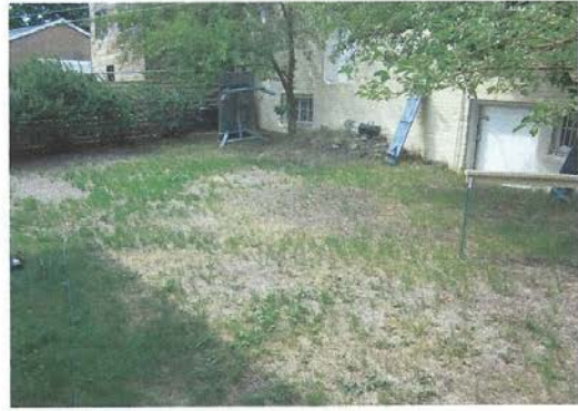
305 W. Granite ( Before)