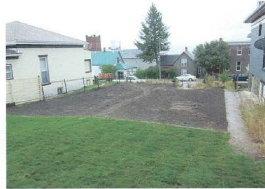
307 W. Granite ( After)