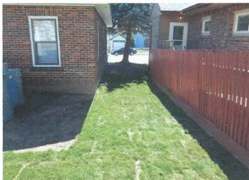
207 E. Second (After)