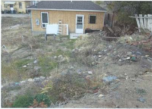
110 Belle (Before)