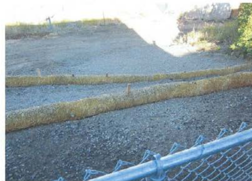
419 N. Washington (After)