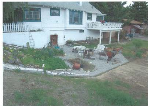
1033 W. Mercury (After)