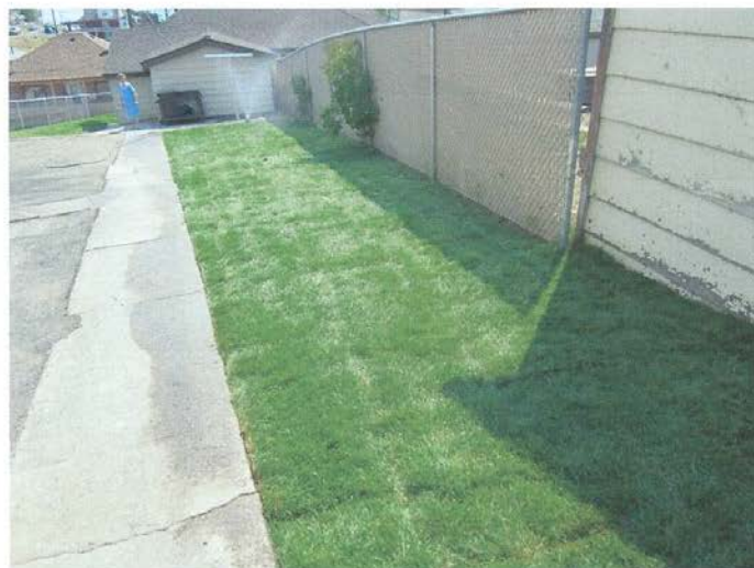
411 Virginia (After)