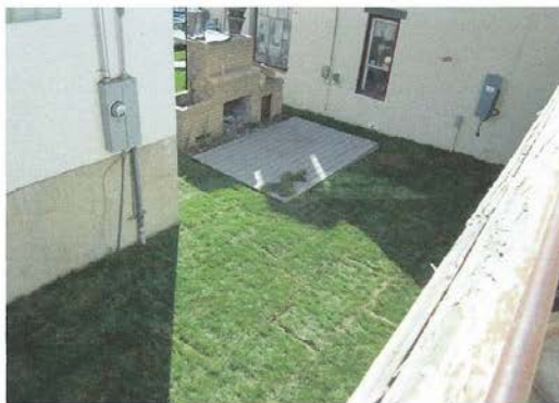
301 W. Granite ( After)