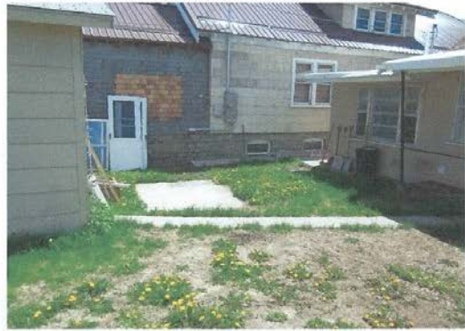
1106 Missouri ( Before)