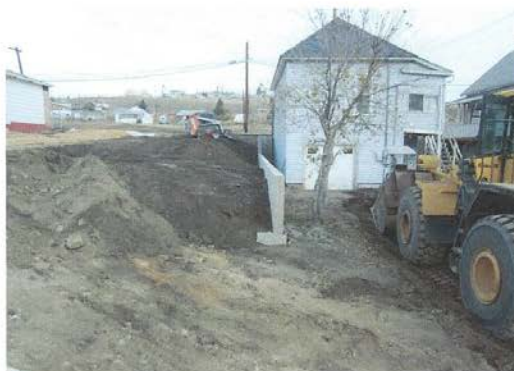
356 E. Mercury ( During)