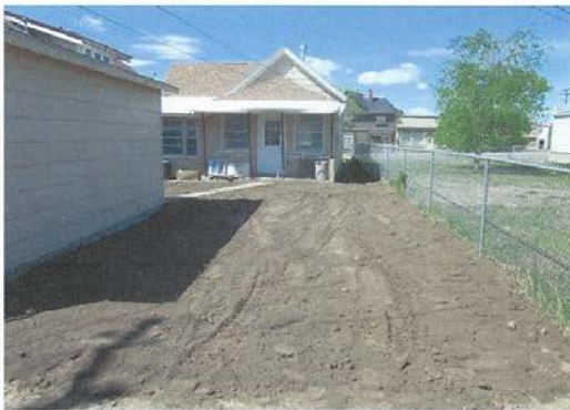
1106 Missouri ( During)