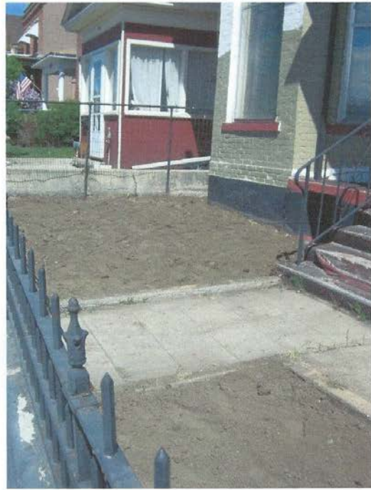
709 W. Park (During)