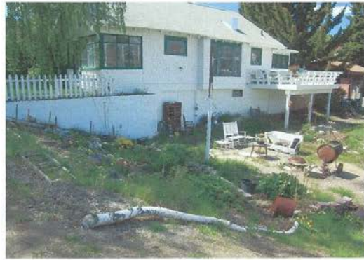
1033 W. Mercury (Before)