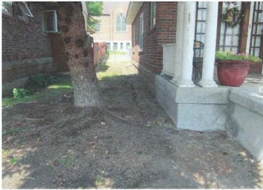
207 E. Second (Before)