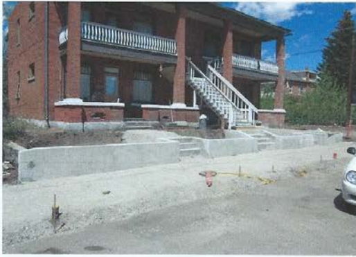
61-67 W. Gold ( Before)