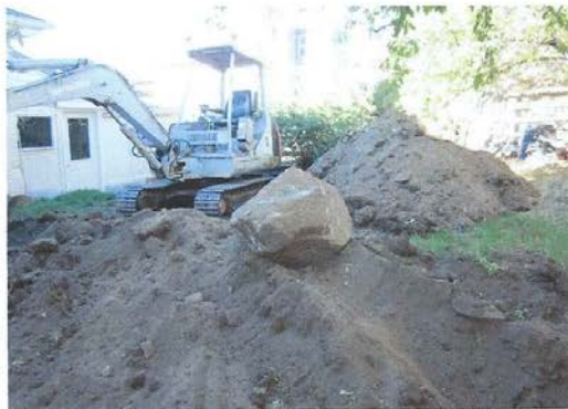
305 W. Granite ( During)