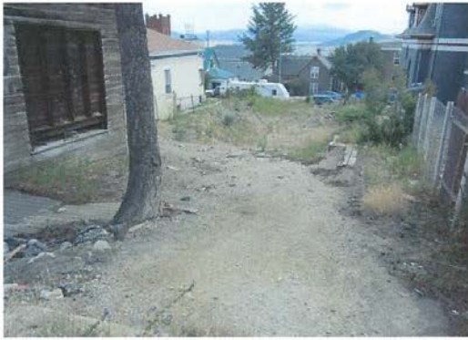
307 W. Granite ( Before)