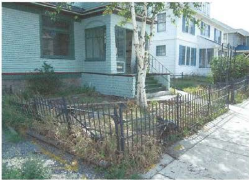
1026 Caledonia ( Before)