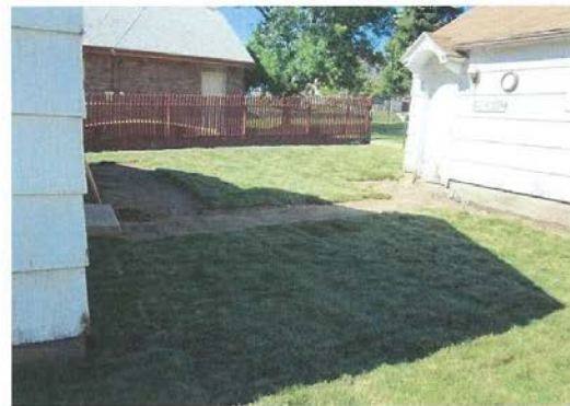
207 E. Second (After)