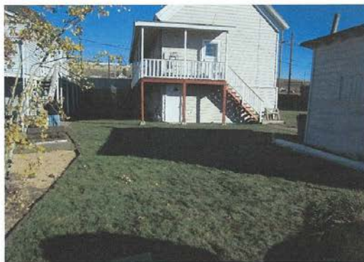
358 E. Mercury ( After)