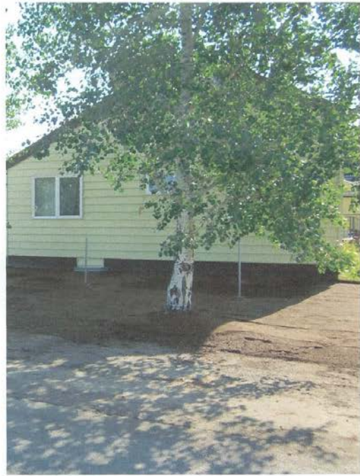
1201 Taft (During)