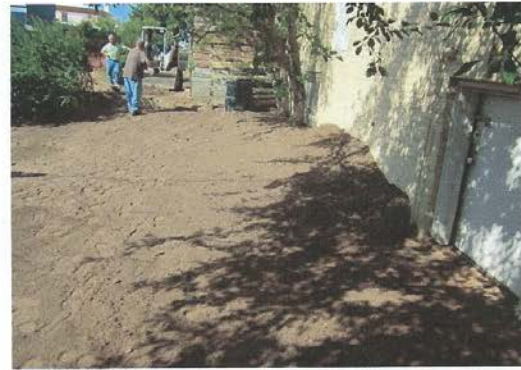
305 W. Granite ( During)