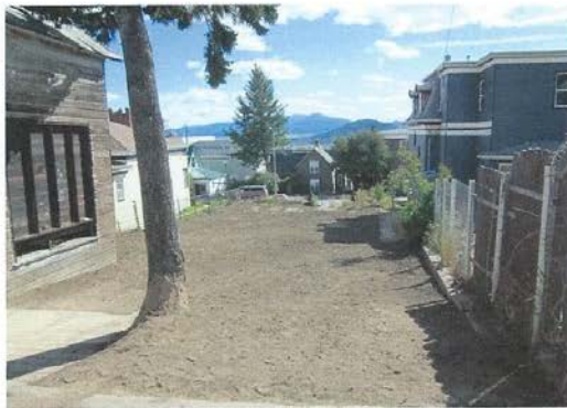
307 W. Granite ( During)