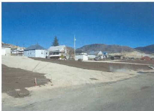
Curtis St. SWS ( During)