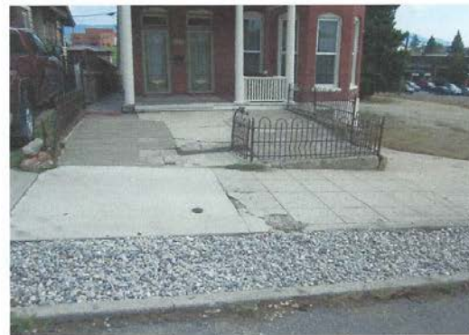
410 Excelsior (After)