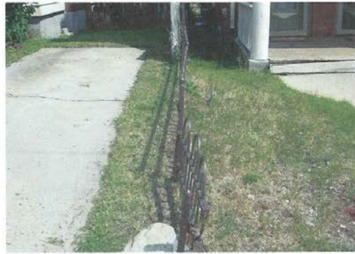
410 Excelsior (Before)