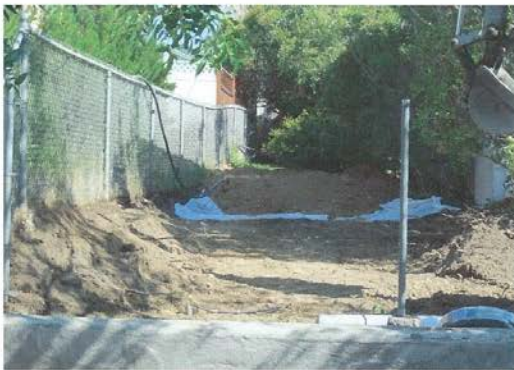
1043 Porphyry ( During)