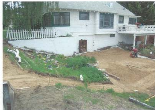
1033 W. Mercury (During)