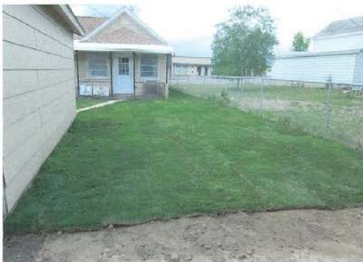
1106 Missouri ( After)