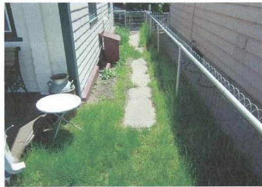
1228 Farrell ( Before)