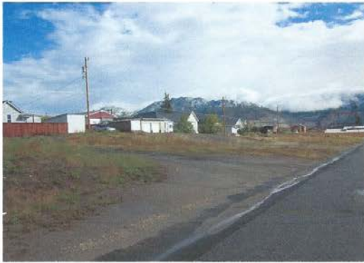
Curtis St. SWS ( Before)