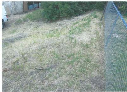
419 N. Washington (Before)