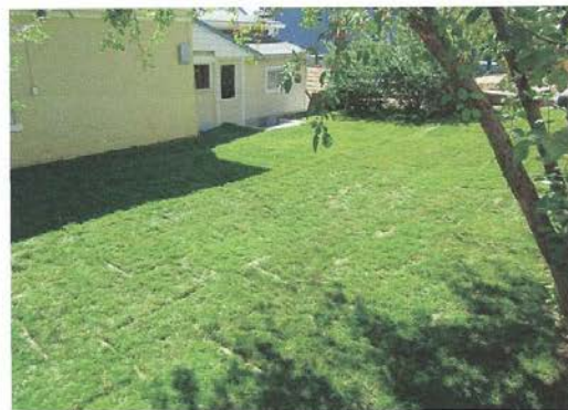
305 W. Granite ( After)