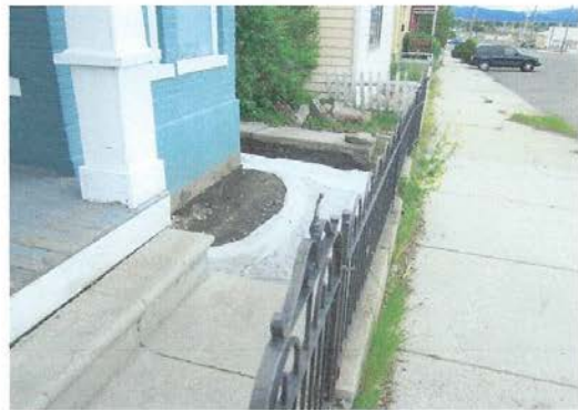
1108 Nevada (During)