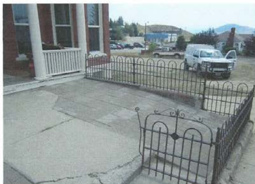
410 Excelsior (After)