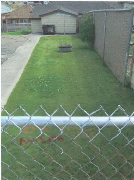
411 Virginia (Before)