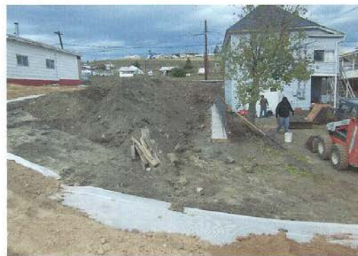
356 E. Mercury ( During)