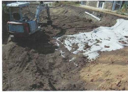
307 W. Granite ( During)