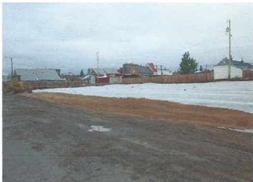
Curtis St. SWS ( During)