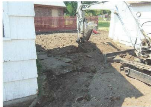
207 E. Second (During)