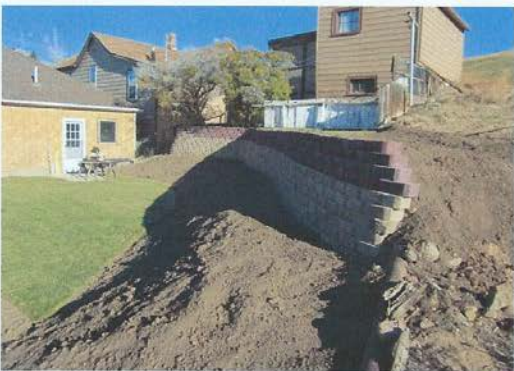
110 Belle (After)