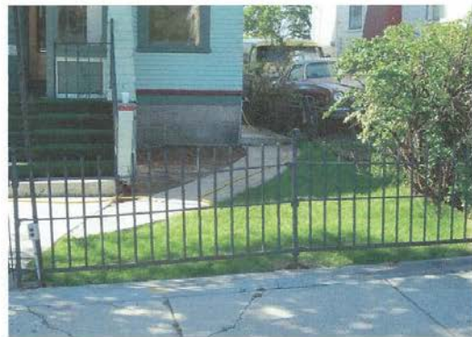
1026 Caledonia ( After)