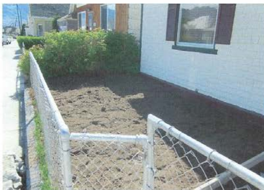
1228 Farrell ( During)