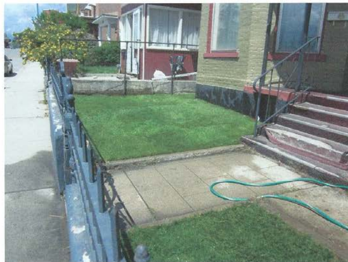
709 W. Park (After)