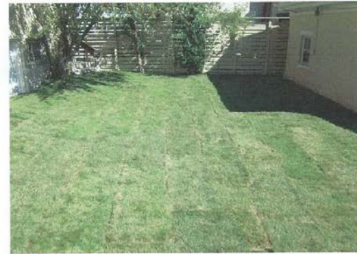
305 W. Granite ( After)