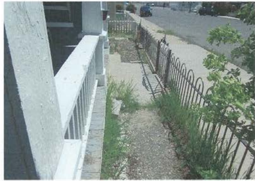
1108 Nevada (Before)