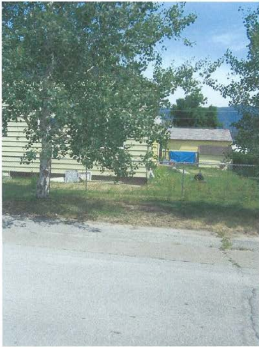
1201 Taft (Before)