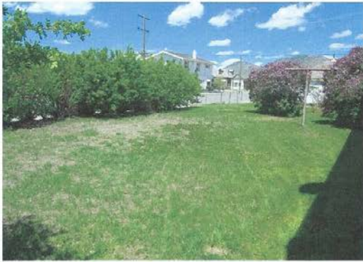
1108 Nevada (Before)