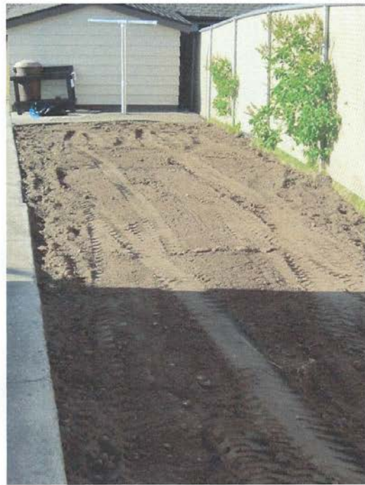
411 Virginia (During)