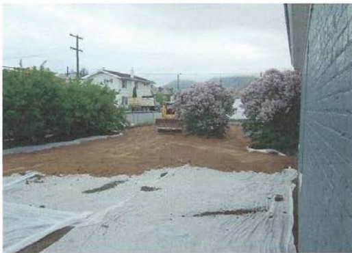
1108 Nevada (During)