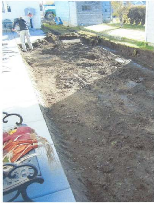
1928 S. Idaho ( During)