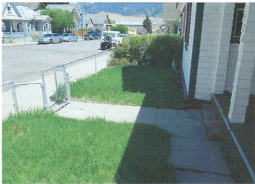
1228 Farrell ( Before)