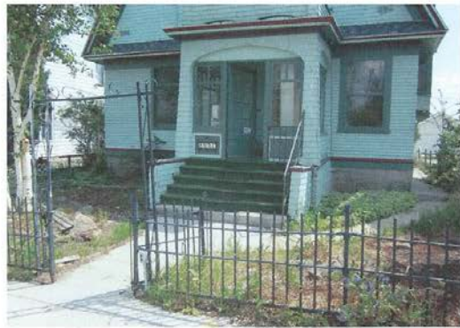
1026 Caledonia ( Before)