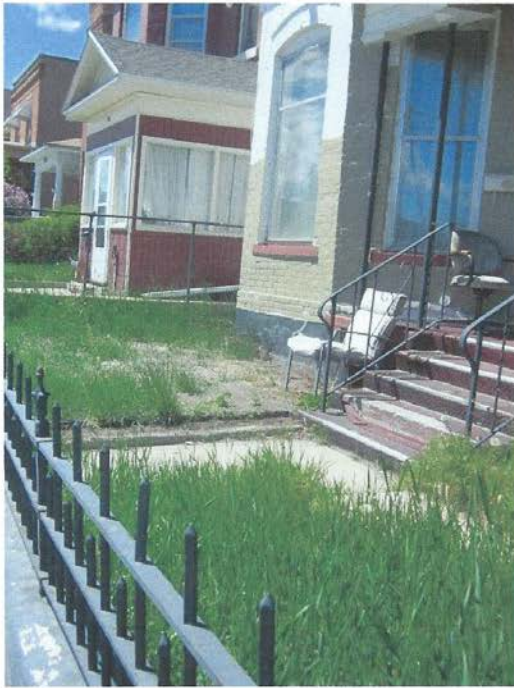
709 W. Park (Before)