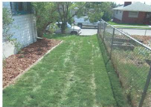
1043 Porphyry ( After)