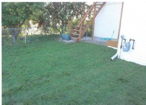
419 N. Washington (After)