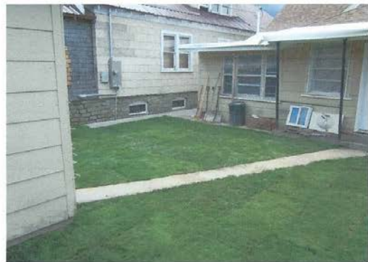
1106 Missouri ( After)