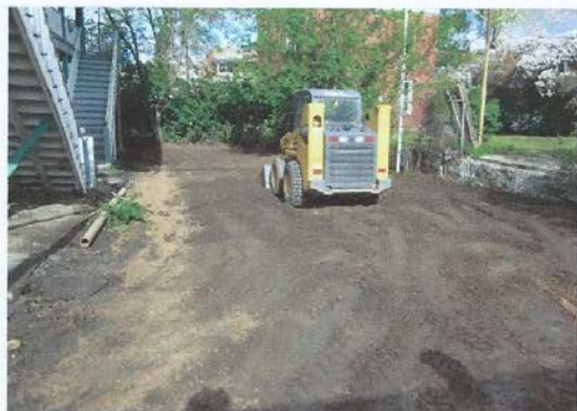
61-67 W. Gold ( During)