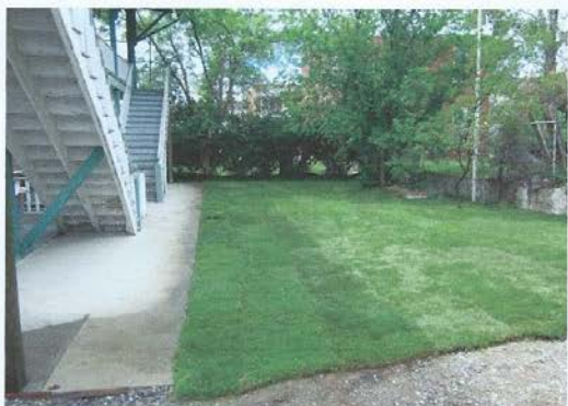
61-67 W. Gold ( After)