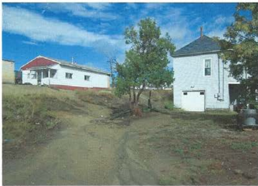
356 E. Mercury ( Before)