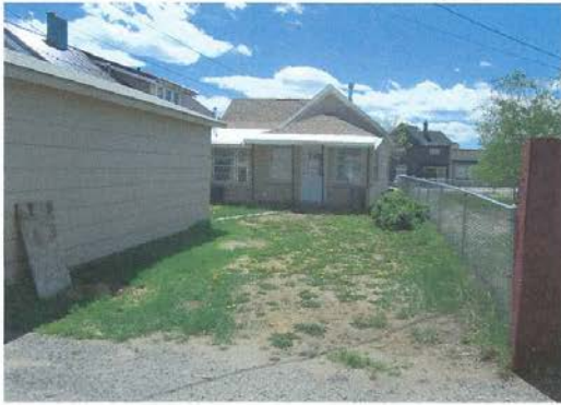
1106 Missouri ( Before)