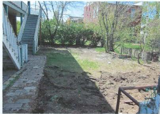
61-67 W. Gold ( Before)