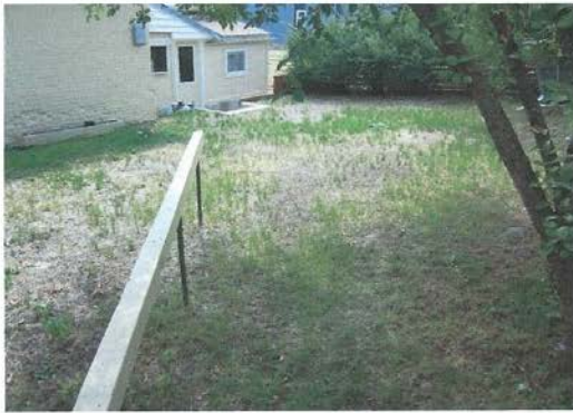
305 W. Granite ( Before)