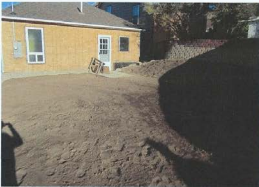
110 Belle (During)