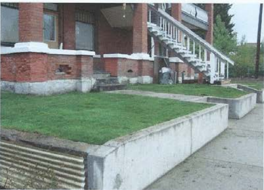
61-67 W. Gold ( After)