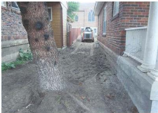
207 E. Second (During)