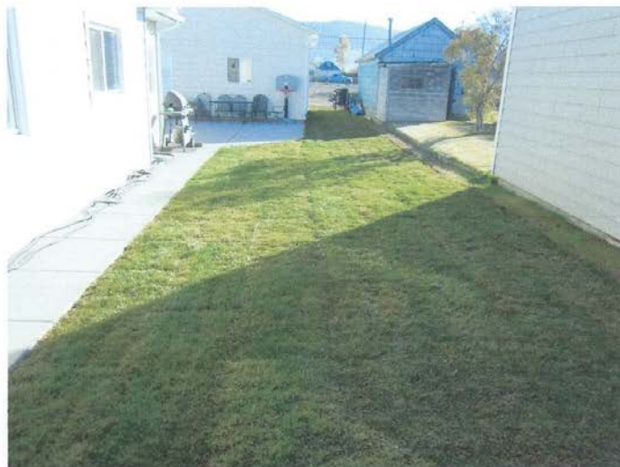
1928 S. Idaho ( After)