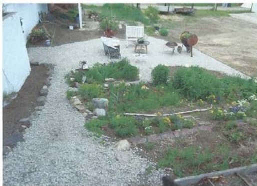
1033 W. Mercury (After)