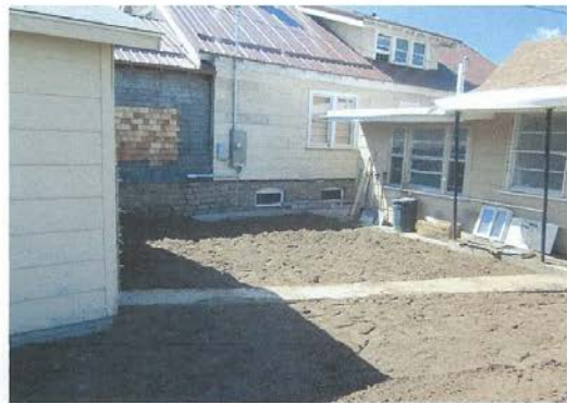
1106 Missouri ( During)