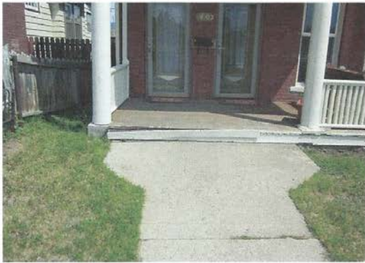
410 Excelsior (Before)