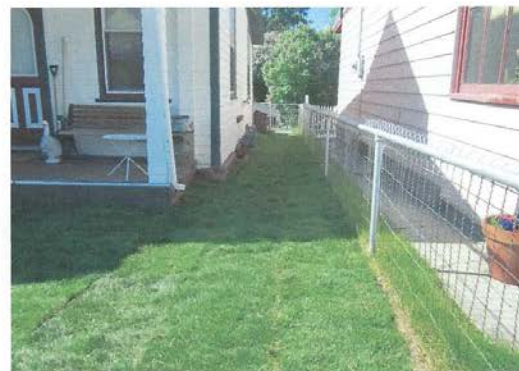
1228 Farrell ( After)