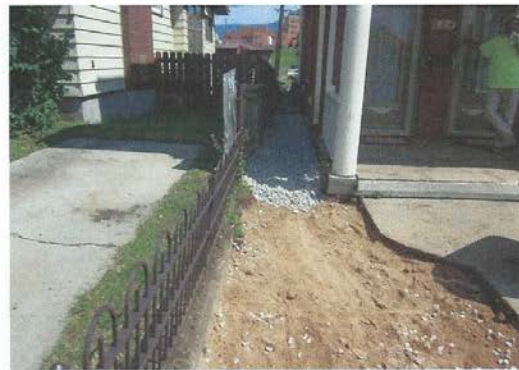
410 Excelsior (During)