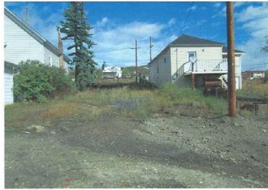
358 E. Mercury ( Before)