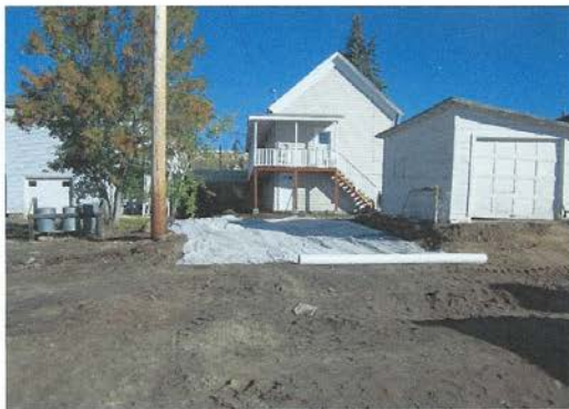
358 E. Mercury ( During)