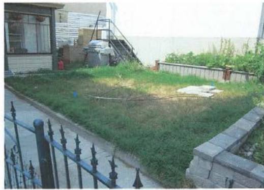
301 W. Granite ( Before)