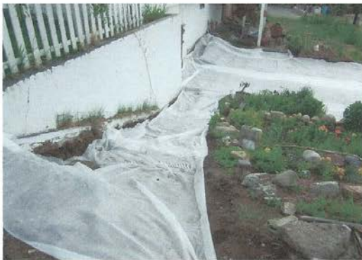
1033 W. Mercury (During)