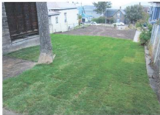
307 W. Granite ( After)