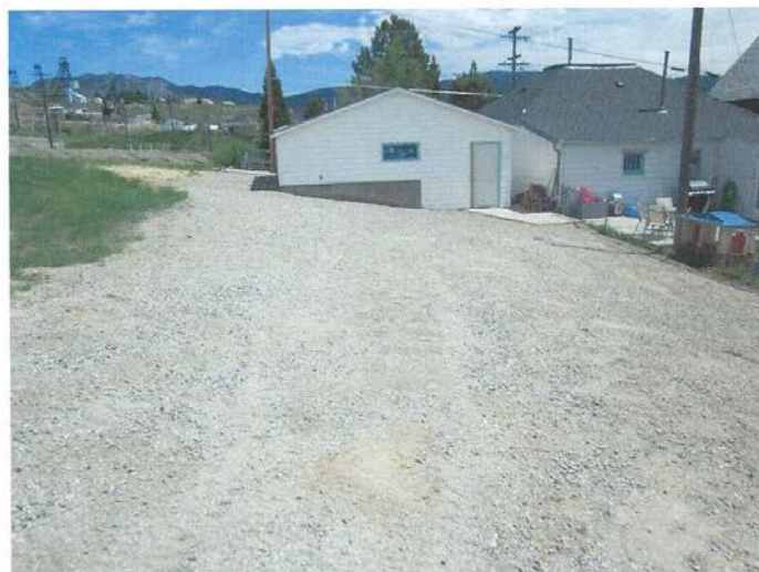
807 N. Montana (After)