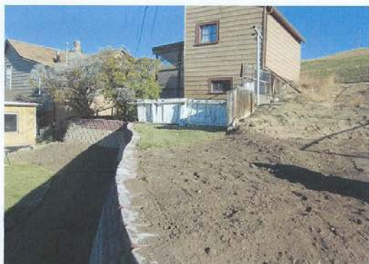
110 Belle (After)