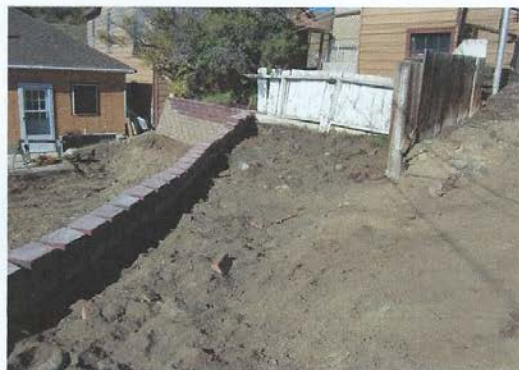
110 Belle (During)