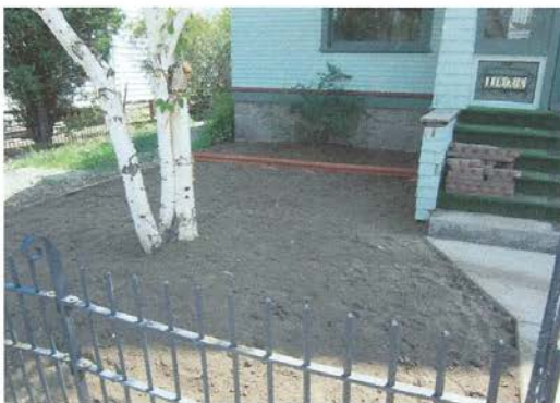
1026 Caledonia ( During)