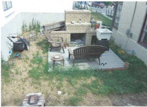
301 W. Granite ( Before)