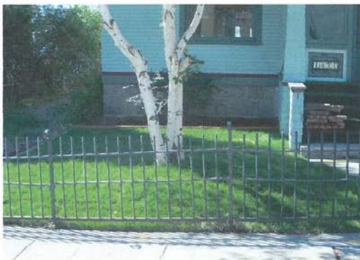
1026 Caledonia ( After)