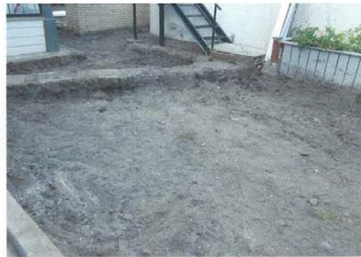
301 W. Granite ( During)