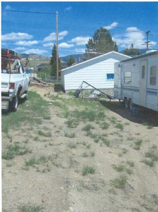
807 N. Montana (Before)