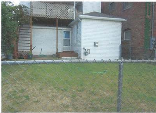
419 N. Washington (Before)