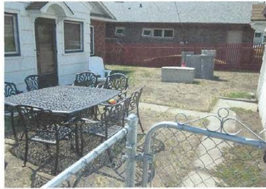
207 E. Second (Before)