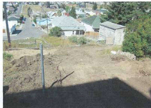
419 N. Washington (During)