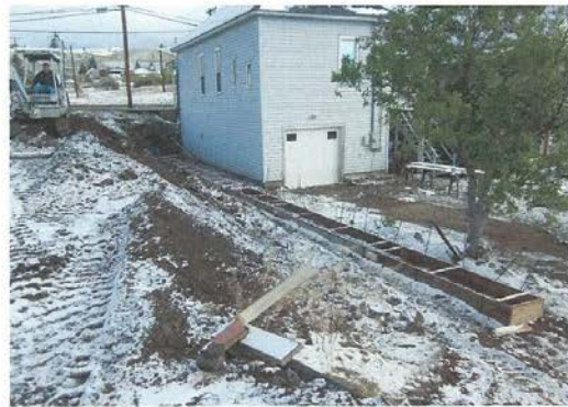
356 E. Mercury ( During)