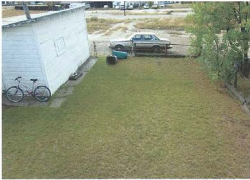
358 E. Mercury ( Before)