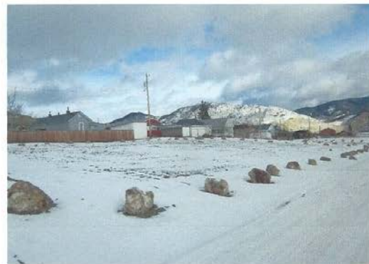
Curtis St. SWS ( After)