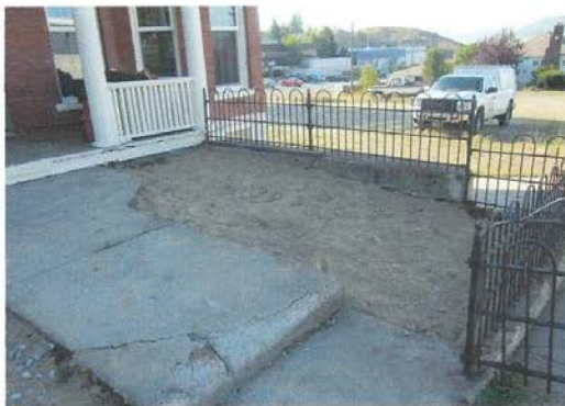
410 Excelsior (During)