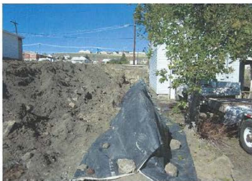
356 E. Mercury ( During)