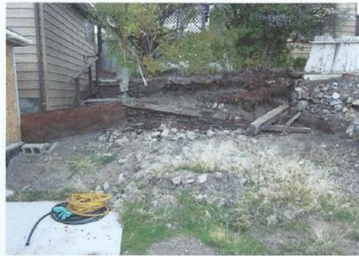
110 Belle (Before)