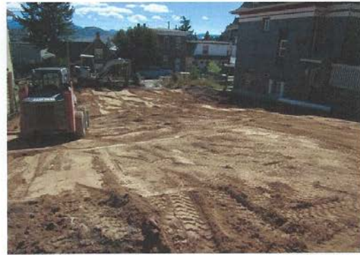
307 W. Granite ( During)