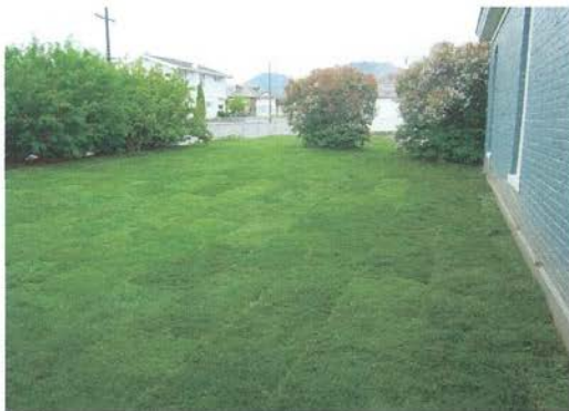
1108 Nevada (After)