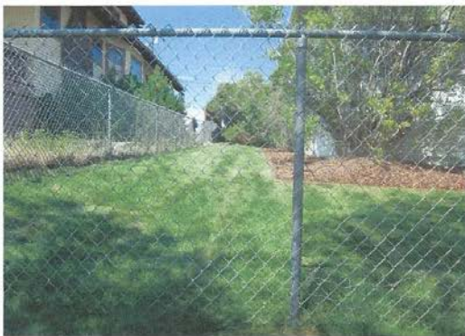
1043 Porphyry ( After)