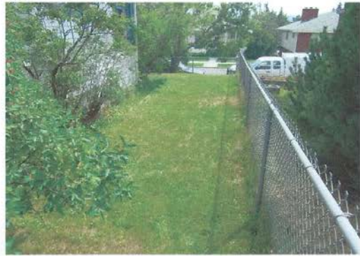
1043 Porphyry ( Before)