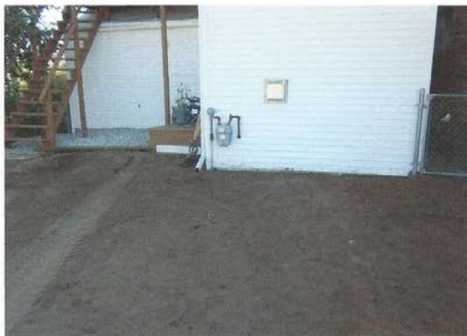
419 N. Washington (During)