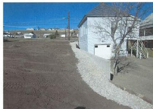
356 E. Mercury ( After)