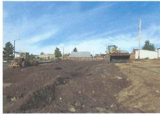
Curtis St. SWS ( During)