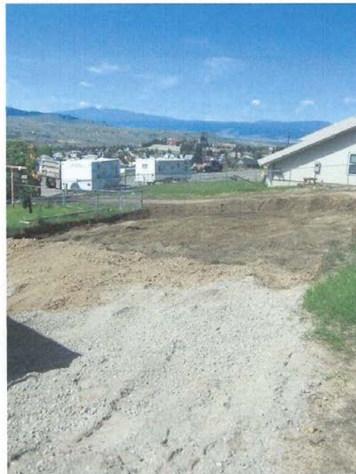
807 N. Montana (During)