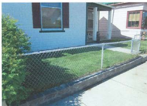
1228 Farrell ( After)