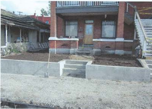
61-67 W. Gold ( During)