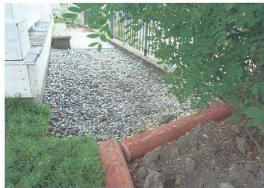
1108 Nevada (After)