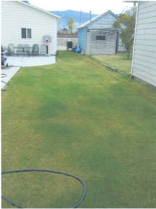
1928 S. Idaho ( Before)