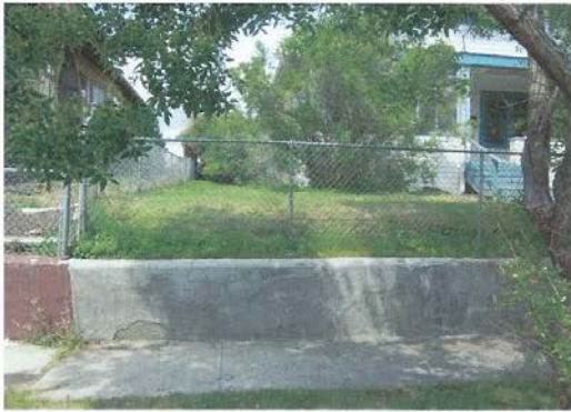
1043 Porphyry ( Before)