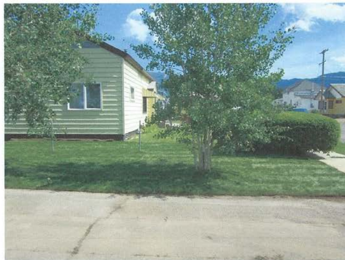
1201 Taft (After)