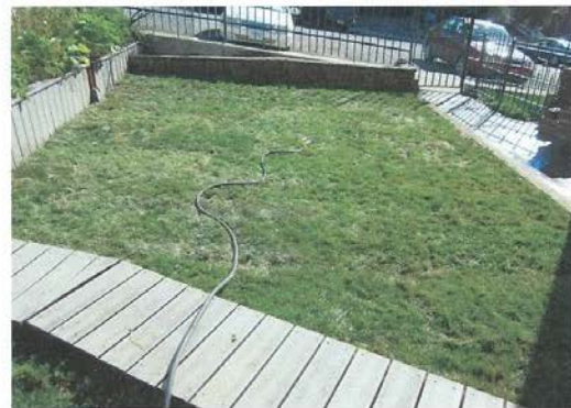
301 W. Granite ( After)