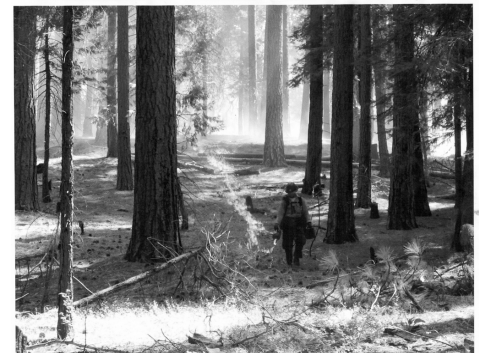
Prescribed fire in the Dinkey Landscape – third entry.

Models predict that in untreated conifer and hardwood stands, fire behavior can be characterized by high-intensity surface fires; torching of trees (passive crown fire) is likely, with active crowning possible depending on wind conditions. Flame lengths range from 7 to 66