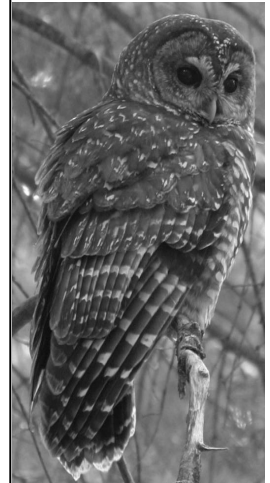
California spotted owl photo taken in Yosemite NP.