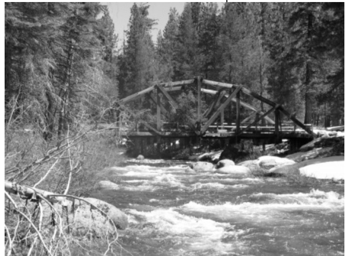
Historic Dinkey Creek Bridge

The Dinkey Planning Forum, which includes scientific technical advisors, will assess successful implementation through improvements in fuels reduction, evaluation of burning program (acres burned vs. burning results), evaluations of habitat improvements (planned vs. actual), and evaluation of restoration treatment effects to California spotted owl and Pacific fisher habitat use, landscape-scale movements, and demographics. The Dinkey Planning Forum will issue a monitoring report annually and host a five year symposium.