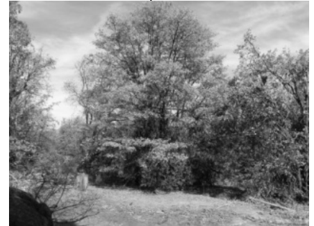
Treatment measures will also enhance the area's scenic quality.

Hardwood forests are treated to create a complex mosaic of habitats that are consistent with frequent fire, with an overall landscape structure of irregular patches and abundant edges. Hardwood densities would decrease and understories would become more open. Consequently, hardwood trees would become larger and more space would become available for oak regeneration and grass production. These measures will also enhance the area's scenic quality. Habitat emphasis areas for deer winter range, California spotted owl, riparian species, and foothill bird species would be identified for each treatment area. Fire, grazing, and planting would be managed to enhance oak regeneration and Native American basket weaving materials. Fire and fuels treatments would be applied strategically to increase the effectiveness of fire suppression activities and assist in reintroducing fire into the hardwood and chaparral vegetation types. Noxious weed treatments and range improvement repairs are used to restore sites impacted by cattle distribution and concentration.