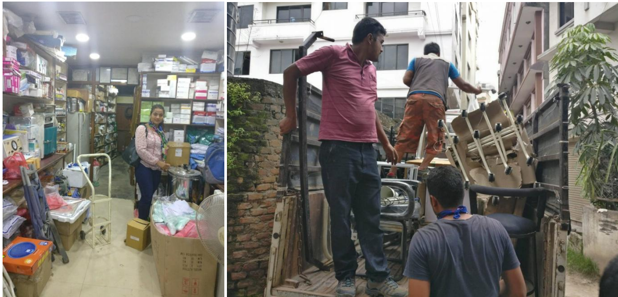
Photo: Purchasing and loading equipments for transportation

These are the medical equipments purchased for the first phase.