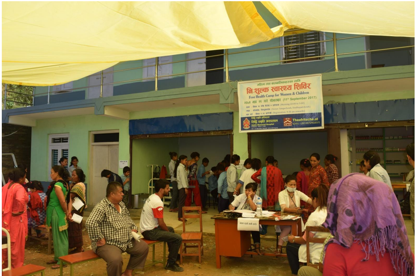
Photo: Health Camp at Sangachok Theo Clinic, Picture: Patients in a queue to get service