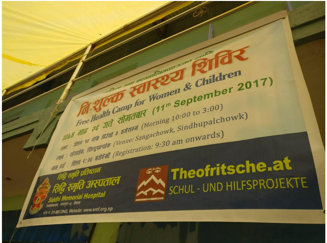
Photo: Women and Children free health Camp at Theo Health Clinic Sangachok