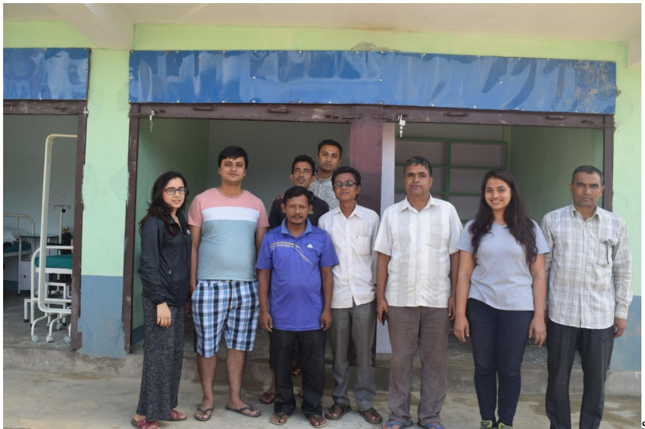
Photo: Construction committee members of Theo Health Clinic

The committee members are selected from various small villages of Sangachok.