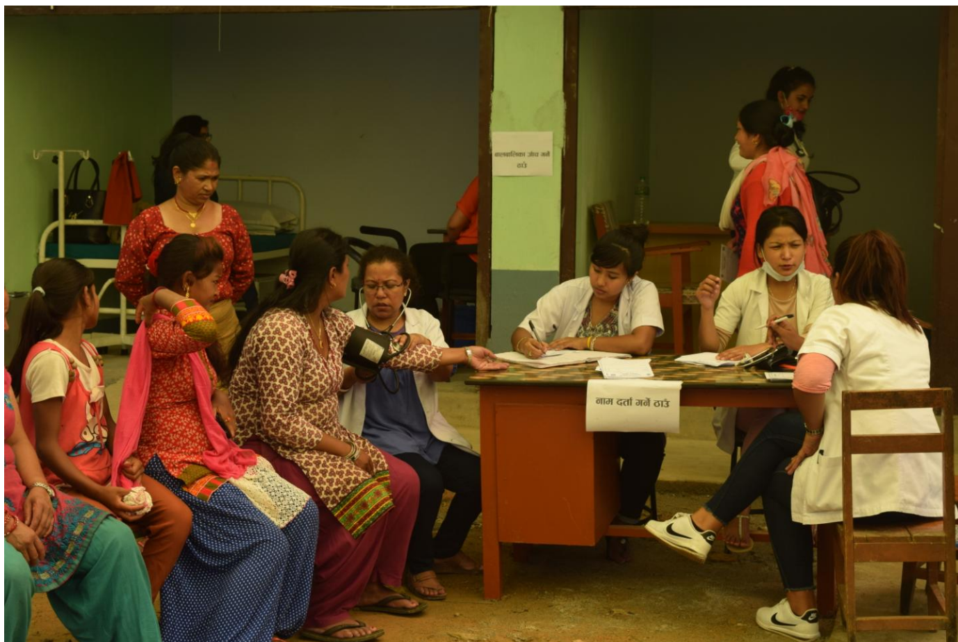
Photo: Women and children health check up