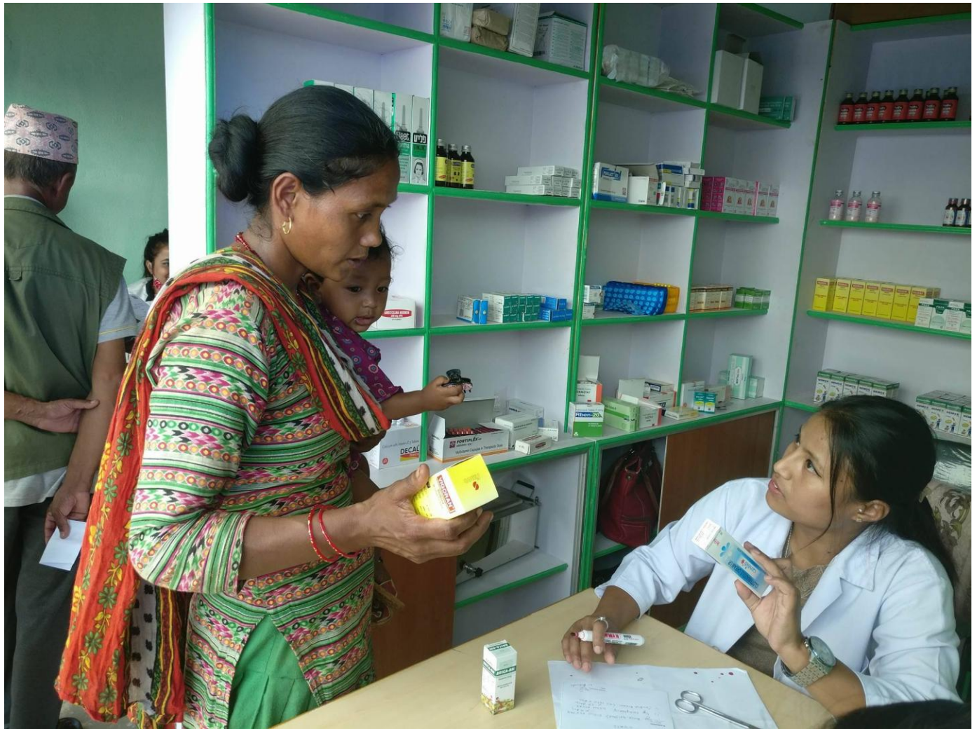
Photo: Patient gets medicine at free of cost at Theo Clinic