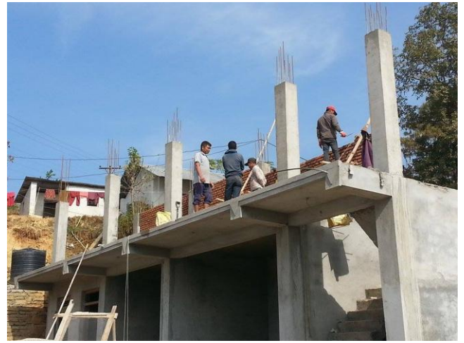
Photo: First Floor Work