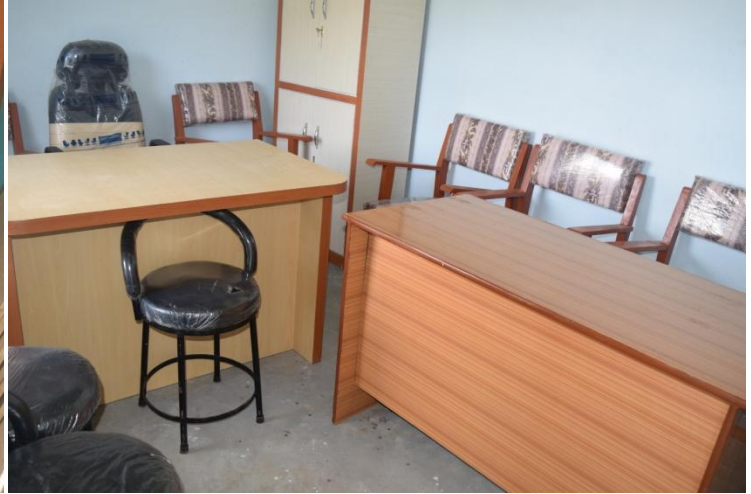
Photo: Medicine Rack, patient name record desk, office room