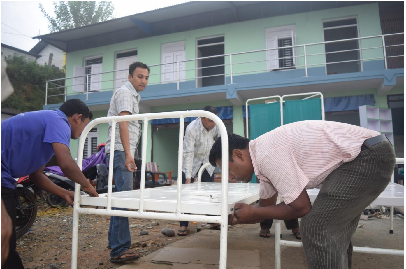
Photo: Fitting the bed for patient at Clinic by community people