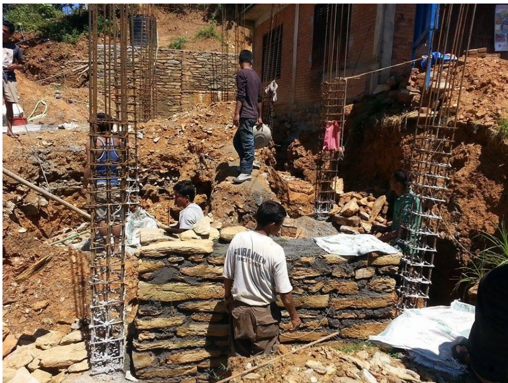
Photo: Basement & Ground Floor Work