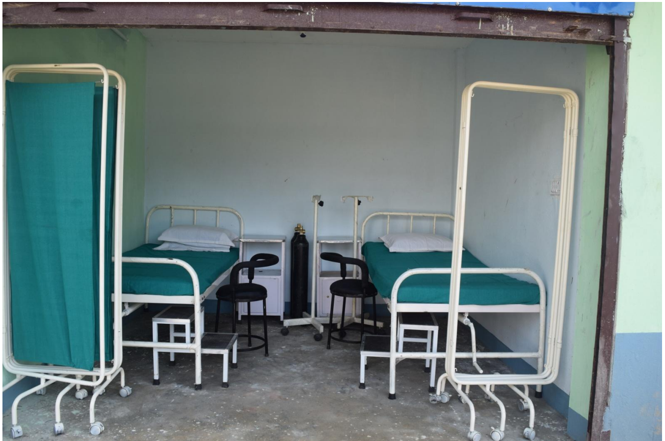
Photo: OPD Room, Examination Room and Medical Equipments