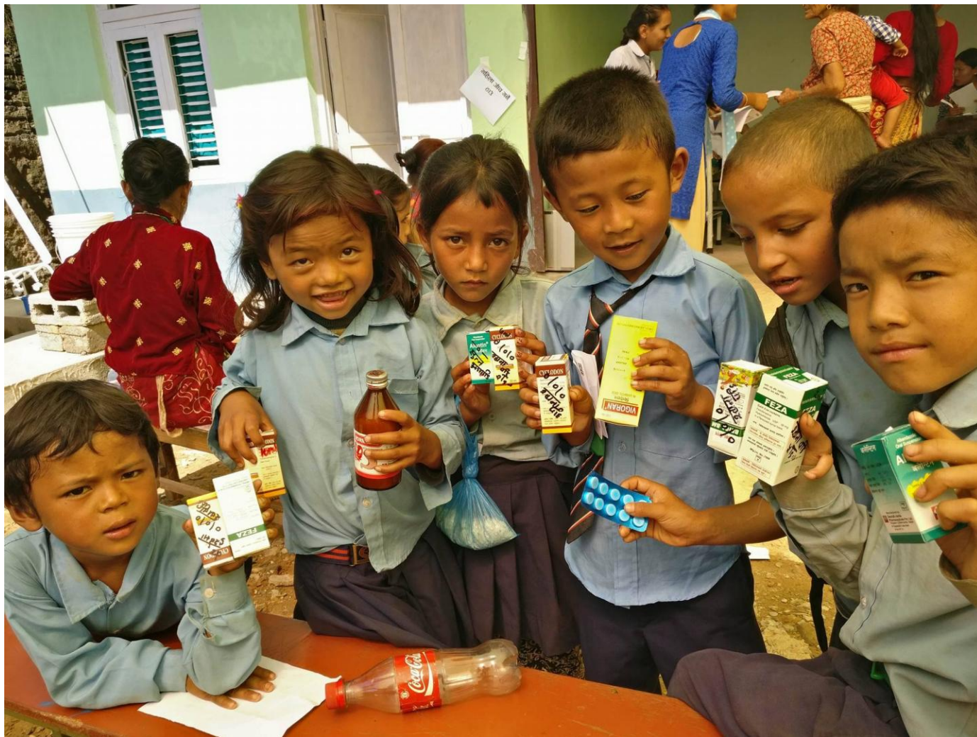
Photo: Children are getting medicine after check up, Patients in clinic