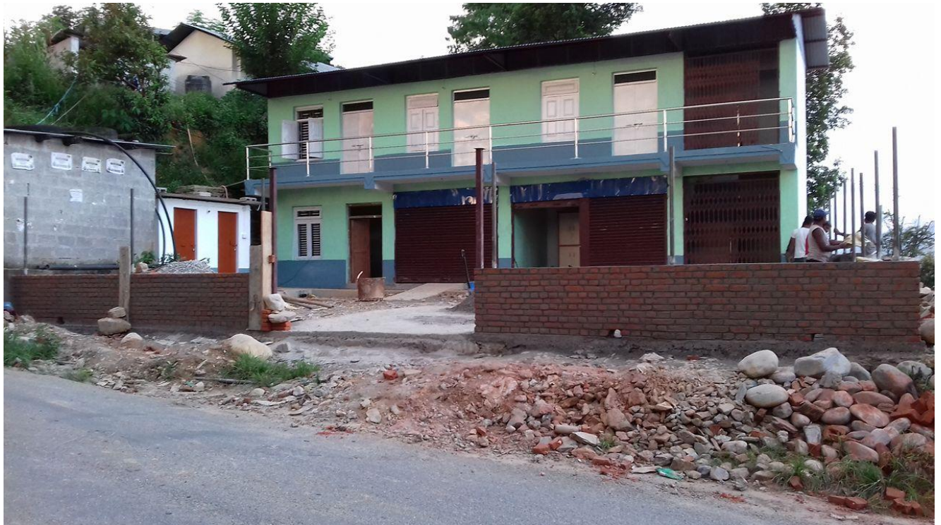
Photo: Construction of Compound Wall