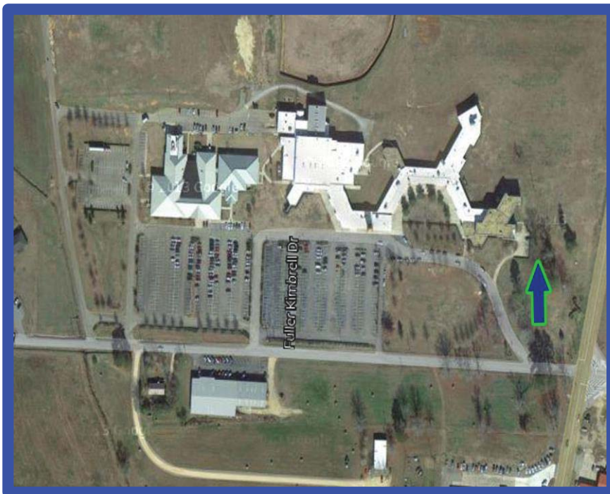
Fayette Campus Free Space Area is designated by a blue arrow.