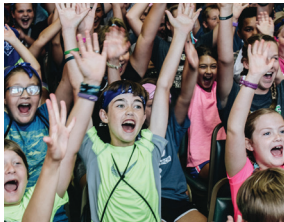
Worship & Bible Study