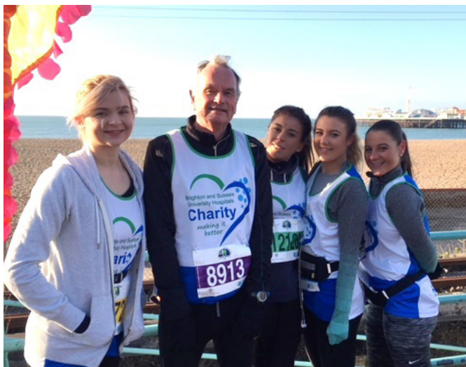
Team BSUH at Brighton Half Marathon

Nine runners ran the Brighton Half Marathon in February 2018 to raise money for the BSUH Charity. More than £3,000 was raised for a few areas within the Trust such as the Ultimate Urgent Care Centre Campaign, the Royal Alexandra Children's Hospital, The Elton John Clinic, and the Intensive Care Unit at the Royal Sussex County Hospital.