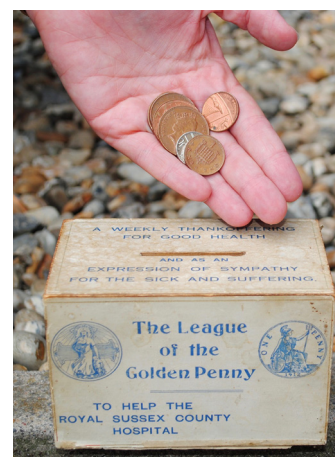
Original early collection box

Today, our supporters can choose to donate to our general fund, or to a particular ward or department. The Charity works closely with frontline clinical staff who guide the purchases made. From jigsaws to chairs, and from a lick of fresh paint to warm blankets and blood pressure monitors, we are helping to make it better for patients.