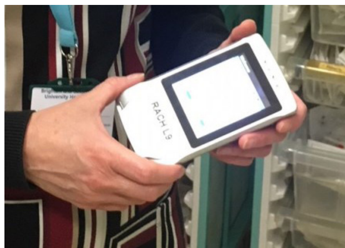
A new ketone meter

Children with diabetes now have one less blood test to wait for, thanks to advanced equipment bought with charity funds. It is vitally important to continually check the ketone levels in these young patients' blood. Previously IV blood tests had to be sent to the lab for review. The new kit reduces the wait, with ketone meters requiring just a simple finger prick done at the bedside - giving instant results.