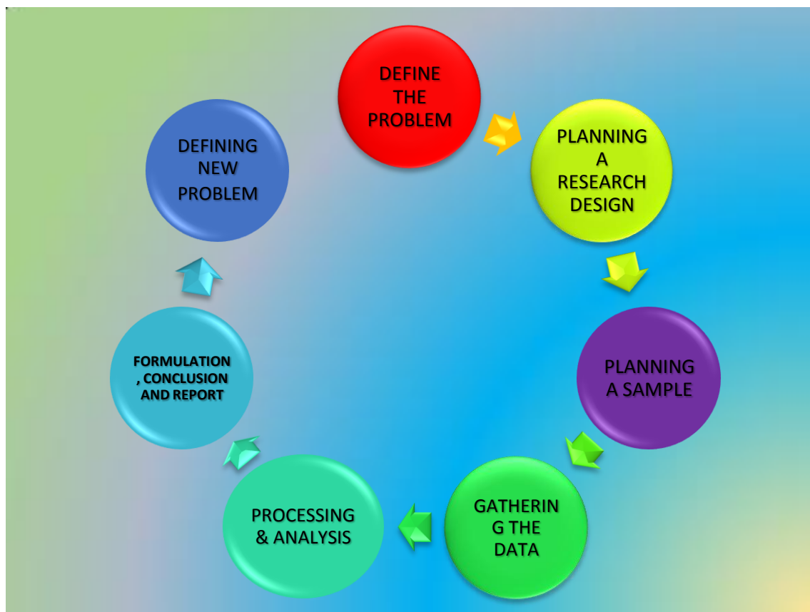
Fig - 4.1 Steps of Research Process

Research Methodology involves the following steps as per the figure 4.1 below: -