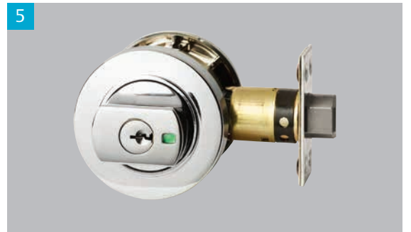
5 Paradigm® 005 Deadbolt (Round Rose)