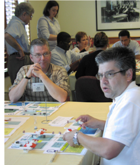
A manufacturing table in action

Participants fabricate parts, process engineering design jobs, assemble, and support a fleet of Lego™ aircraft, to satisfy customer and corporate demands. Each participant is in charge of a facility: an assembly plant, subcontractor fabricating plant, product development department, or service and support depot. A sophisticated economic system allows participants to track their performance and justify their decisions as they progress on their lean enterprise journey. During the course of the simulation, participants learn advanced lessons in applying lean at the enterprise level, quantifying the value of lean improvements, and managing change in a complex, interdependent enterprise.