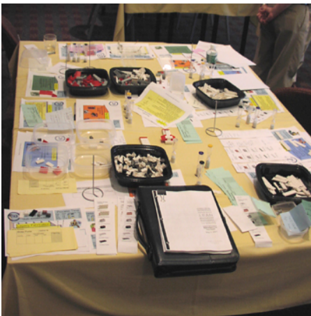
A supplier network table at rest