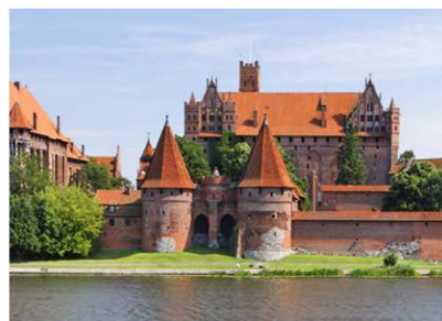
Gdańsk (Gdynia), Poland

Originally a Viking fishing village founded in the 10th century, the Danish capital boasts over 850 years of history.