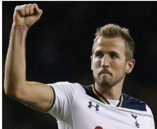
Figure 1: A very fine footballer