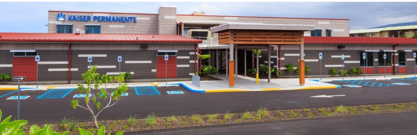
Kona Medical Office