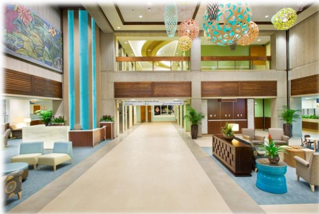
Moanalua Medical Center