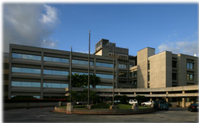
Moanalua Medical Center