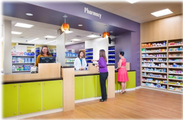
Koolau Medical Office