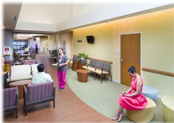
Koolau Medical Office