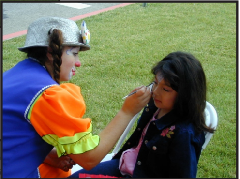
It's not Just Facepainting It's Body Art !