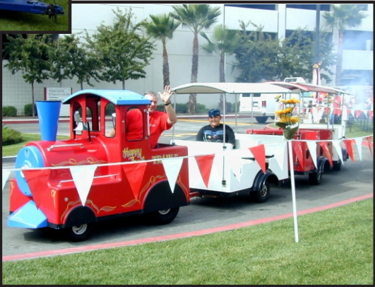
Trackless Train complete with Engineer