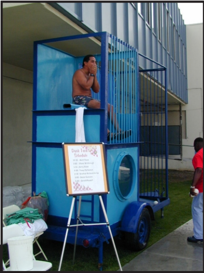
Time to Cool Off in our Deluxe Dunk Tank Complete with Viewing Window