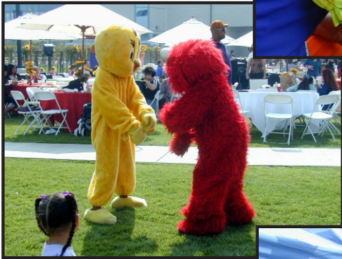
Invite Tweety or Elmo along with many of their other Character Friends to Your Picnic