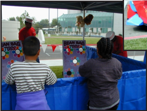
Fun at the Carnival Style Games Booth