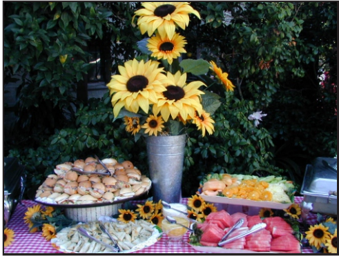
What's a Picnic without Great Food?