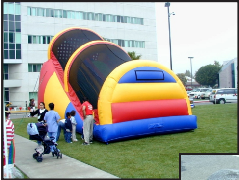
This Three Story Tall Giant Slide is Fun Just Waiting to Happen