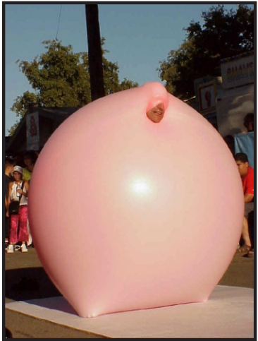
Skip Banks "The Balloon Man" The Only Act with a "Funny Back Guarantee"