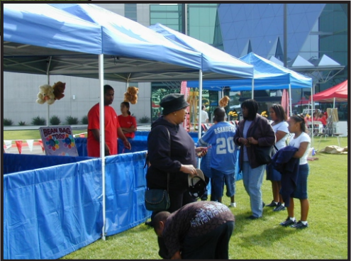
You can Line up a Whole Day's Worth of Fun in Our Carnival Booths Games - Cotton Candy Popcorn - Sno Kones Facepainting - Temporary Tatoos