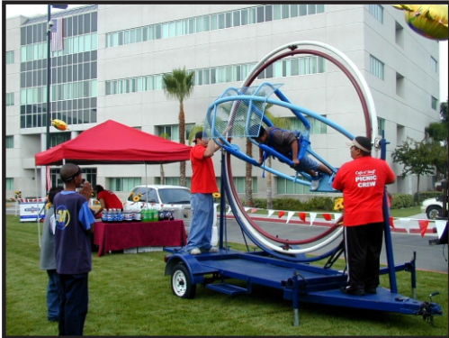
Round and Round and Round They Go..... Fun for Young and Old The Gyro